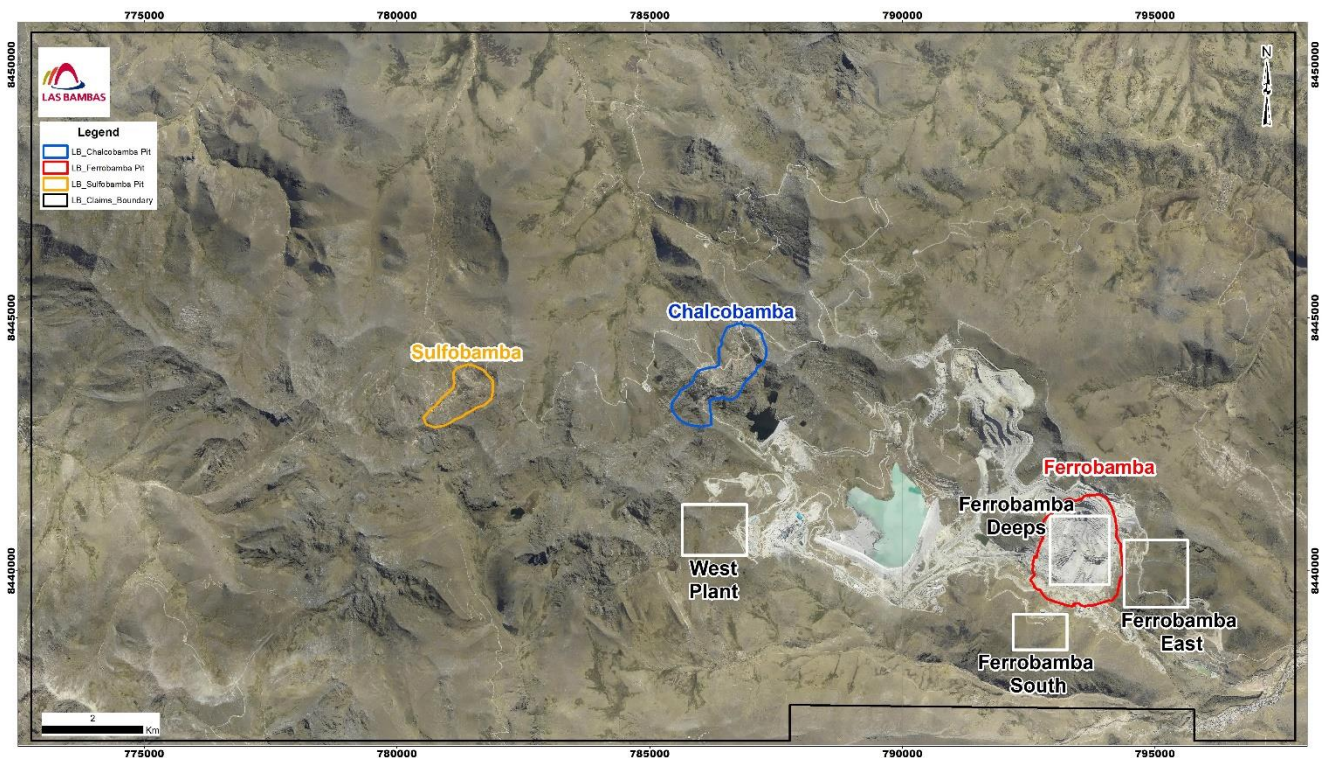
Figure 1. Outline of Las Bambas Mining Concessions highlighting the location of Reserves and Resources (in color) as well as the Ferrobamba Deeps, Ferrobamba East, Ferrobamba South and West Plant exploration targets.

During the quarter, 4,428 meters of drilling were completed on 12 drill holes at the Ferrobamba Deeps target. This drilling tests the depth extension of the higher-grade mineralisation currently being mined by the open pit. The targeted mineralisation could either serve to deepen the existing open pit or provide future ore for underground mining operations. A Proof of Concept Study was completed in the first quarter of 2023 which supported the decision to move to the next study phase.