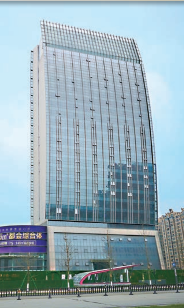
Regal Xindu Hotel, hotel development at Regal Cosmopolitan City