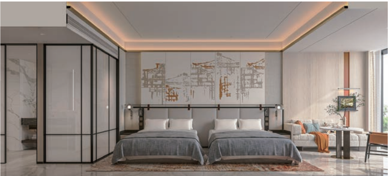
Guestroom at Regal Xindu Hotel (*)