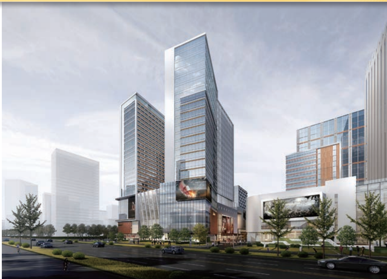
Commercial/office towers of Regal Cosmopolitan City (*)