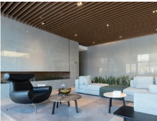
Lobby of an office tower