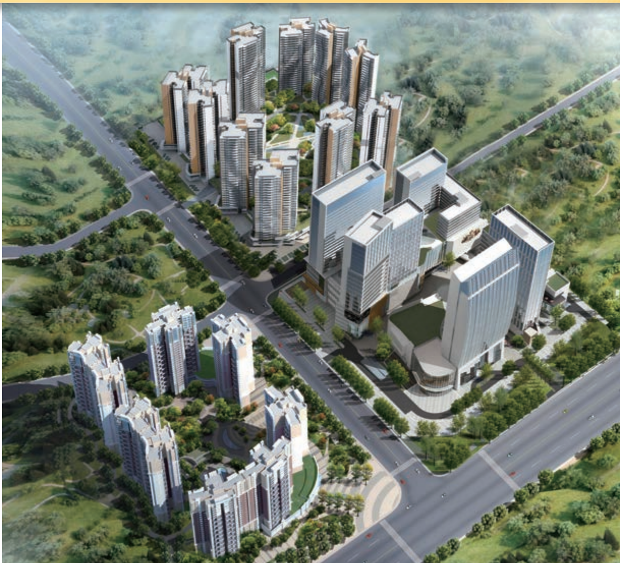
Regal Cosmopolitan City, a composite residential/commercial/office/hotel development in Xindu District, Chengdu, Sichuan