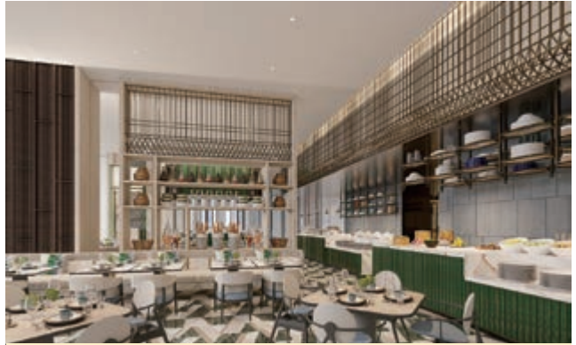
All Day Dining Restaurant at Regal Xindu Hotel (*)