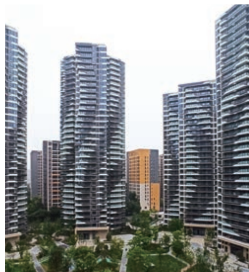
Casa Regalia (Phase 1 and Phase 2), Regal Cosmopolitan City - completed