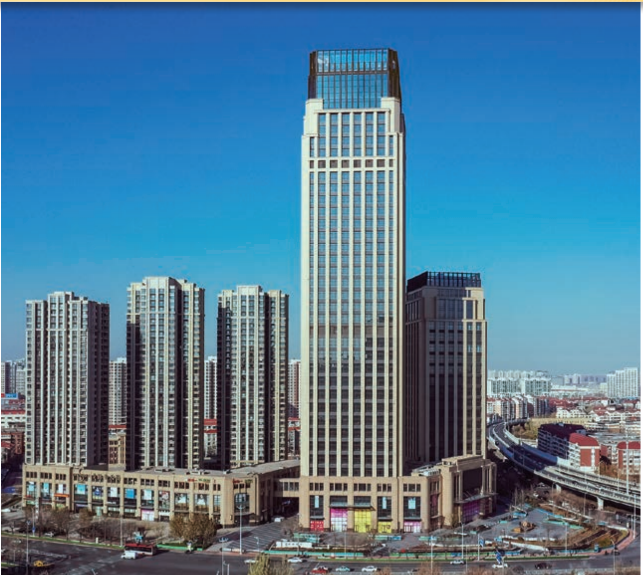
Regal Renaissance, a composite commercial/office/residential development in a prime location of Hedong District, Tianjin