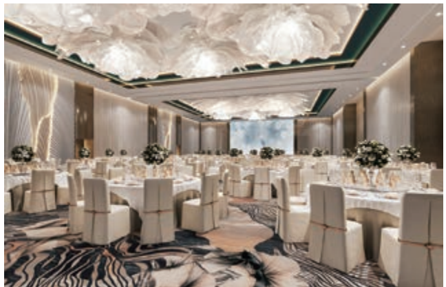
Ballroom at Regal Xindu Hotel (*)