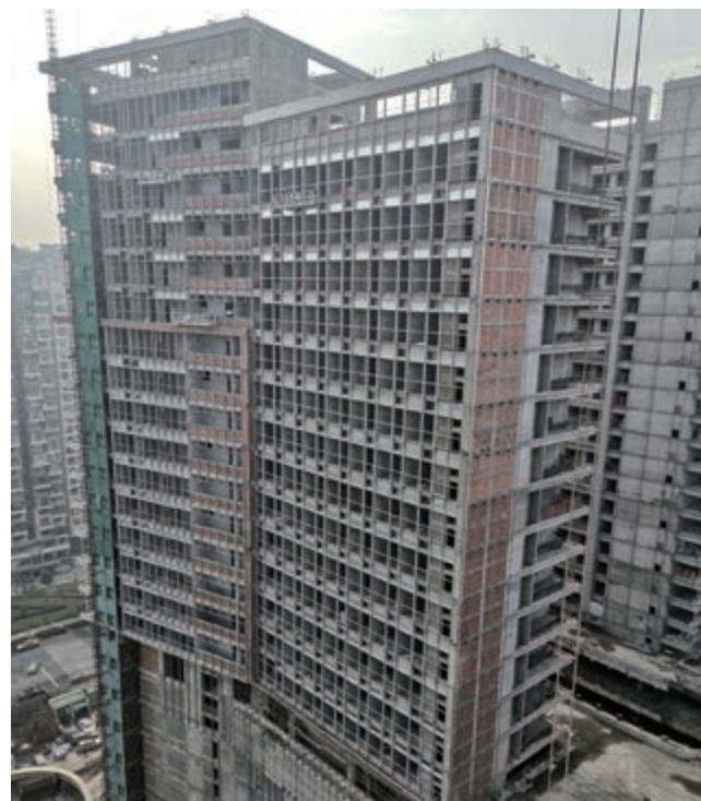
Commercial/office towers of Regal Cosmopolitan City - superstructure works in progress