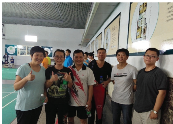
羽毛球比賽 Badminton match

The Group established labour unions according to the requirements of The Trade Union Law of the People's Republic of China (《中華人民共和國工會法》) and the General Principles of The Civil Law of The People's Republic of China (《中華人民共和國民法通則》). The union will enhance the communication with staff and, for them, organise various meaningful and entertaining team-building activities including sports competition, skill competition and leisure activities, etc.