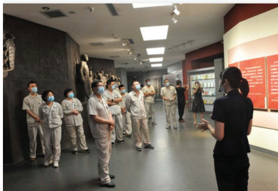
實地考察 Field trip

本集團提供平等就業機會，保障僱員不因年齡、民族、種族、性別及宗教信仰不同而遭受歧視，並致力營造平等、尊重、多元化及互助友愛的企業文化與工作氛圍。本集團提供不少於相關政府法例及法規的休息時間及假期，並同時保障僱員權益及致力建立和諧的勞工關係。