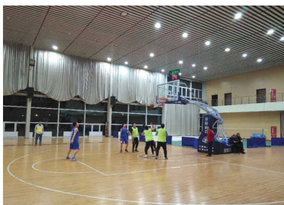
籃球比賽 Basketball match