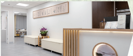
TDMall (Tsim Sha Tsui) 天大館(尖沙咀)