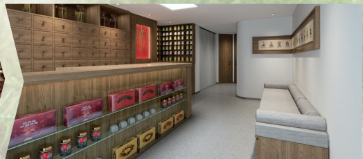
TDMall (Causeway Bay) 天大館(銅鑼灣)