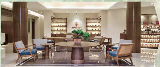
Zhuhai TDMall 珠海天大館