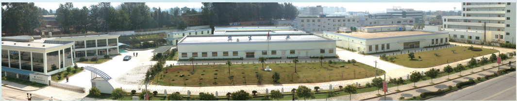
Kunming R&D and Production Base 昆明研發及製藥基地