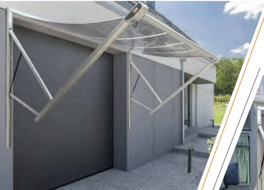
For Carport 車庫用

Golden Solar New Energy Technology Holdings Limited 金陽新能源科技控股有限公司 (Incorporated in the Cayman Islands with limited liability) (於開曼群島註冊成立的有限公司)