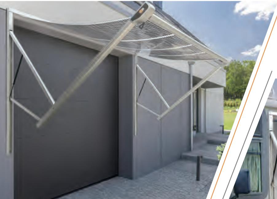
For Carport 車庫用

Golden Solar New Energy Technology Holdings Limited 金陽新能源科技控股有限公司 (Incorporated in the Cayman Islands with limited liability) (於開曼群島註冊成立的有限公司)