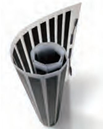
Rollable Solar Module 卷繞式太陽能組件

www.goldensolargroup.com Stock Code:1121 股份代號:1121