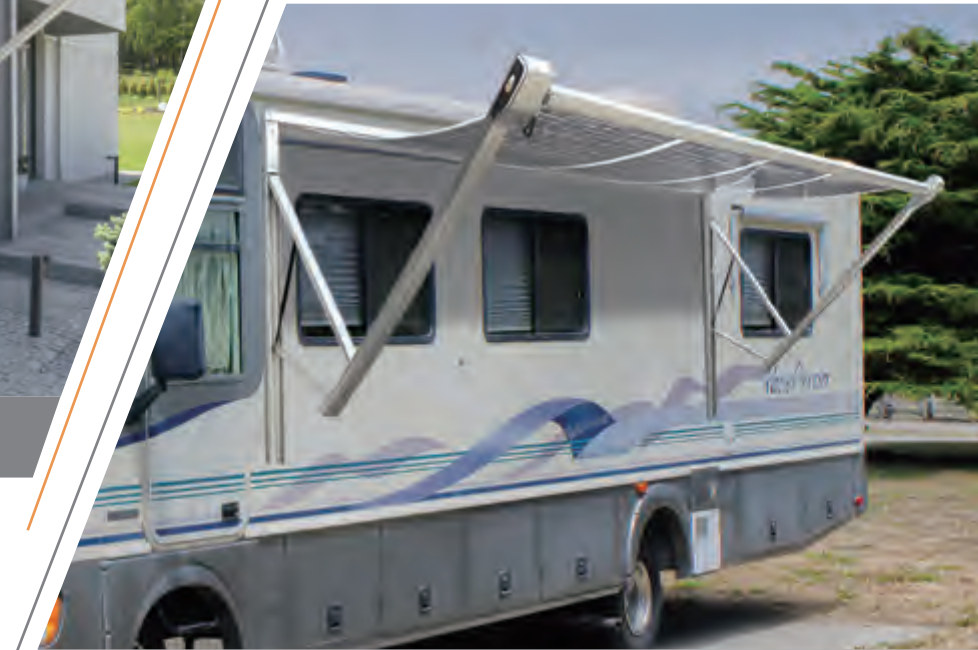
For Recreational Vehicle 休閒車用