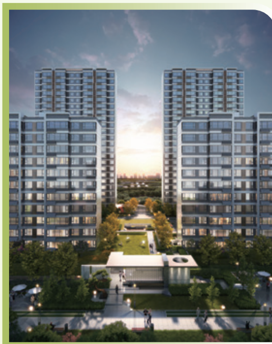
4 Jinan Poly Park TOD 濟南保利公園上城