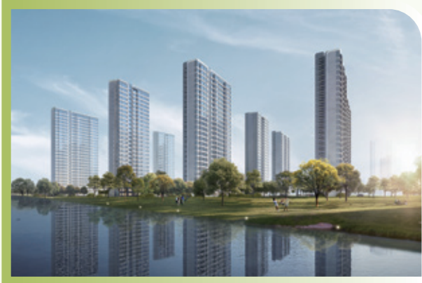
2 Kunshan Moonlight Jade 崑山明月璟辰苑