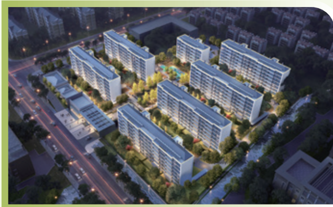
6 Changshu Poly Longyue Mansion 常熟保利瓏悅居