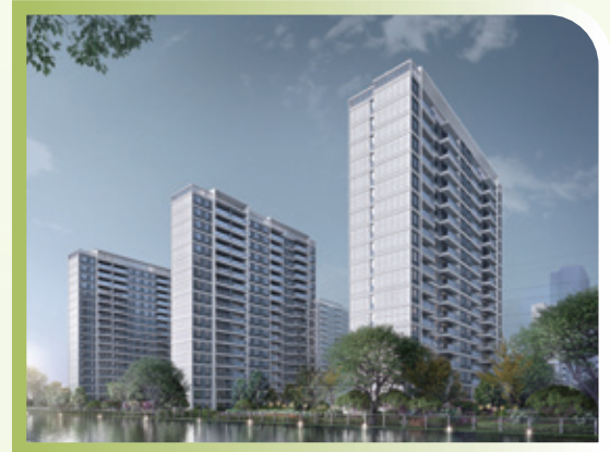
5 Suzhou Riverside Time Zone 蘇州濱河灣花園