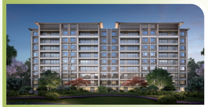
3 Changzhou Poly Jingyue Palace 常州保利景玥府