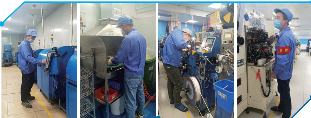
Safe Working Environment 安全工作環境

生產部門負責機器的安全檢查，並由符合資格的外部維修公司進行定期檢查。設備部於生產車間的當眼位置貼上安全隱患的警告標示，以提示員工工作場所的潛在危險（如化學、電器、火災、車輛、滑倒、絆倒和墜落的危險）。本集團還教育員工生產設備、安裝設備、消防設施、防護器材和急救工具的正确使用方法。設備部進行月度及季度安全檢查，為發現的安全隱患制定整改計劃及設定完成期限，並於安全生產例會中跟進有關整改工作，以保證設備處於良好及安全的生產狀態，例如：設備部於安全檢查中，發現應急燈光照度不足，員工可能因此無法快速疏散離開事故現場，或於火災時未能及時找到消防設備等，設備部已為此進行評估及跟進。本集團為員工提供符合國家規定的勞動安全衛生條件和必要的勞動保護用品，確保員工有足夠的防護措施下工作，減少工傷意外的發生。