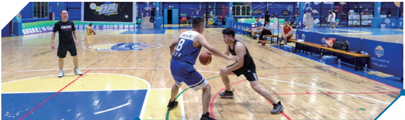
Staff Activities 員工活動