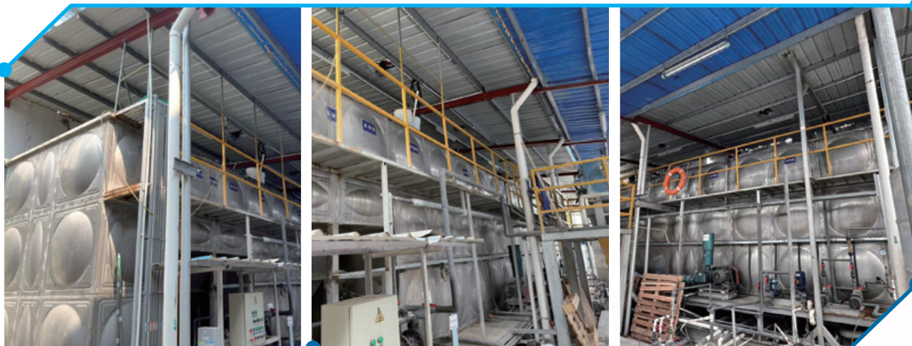
Sewage Treatment Facilities 廢水處理設施

本集團獲得當地政府的污染物排放許可證，並按照《污染源自動監控管理辦法》，於廠房設置污水處理站及在線監控系統，當地生態環保局皆能透過信息發布平台，隨時監察氨氮排放量和化學需氧量的數據；而且每年委託合法檢測機構檢測廠房各排放口的廢水，內容包括水質酸鹼值、懸浮物、化學需氧量、五日生化需氧量、氨氮、總磷及動植物油，本集團於報告期內的檢測結果均符合國家的《水污染物排放限值》及《電鍍污染物排放標準》。地方環保部門除了透過線上監測設備即時監測廢水含污量外，亦會每年不定期對廠房的排污情況進行檢測；於報告期內，本集團未有收到有關部門任何廢水超標排放的通知。