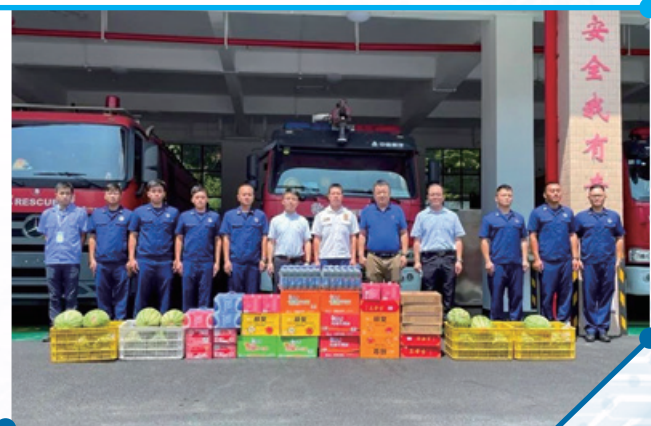
Condolences to Epidemic Prevention Personnel and Fire Brigade Activities 慰問防疫工作人員與消防人員活動