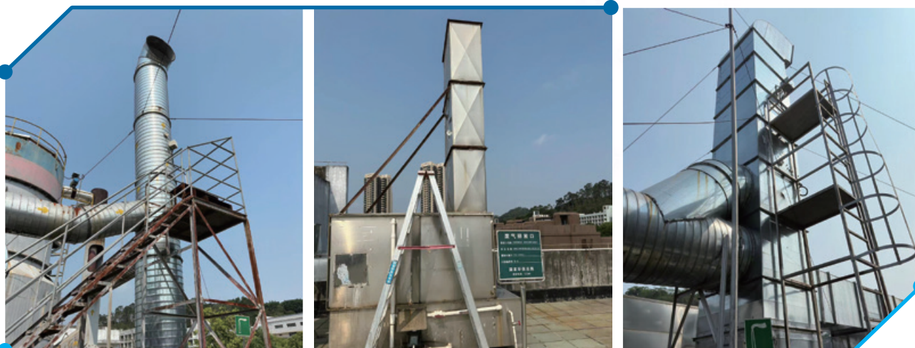
Exhaust Air Treatment Facilities 廢氣處理設施

本集團根據環境管理系統制定了「污染物管理程序」，生產設備與廢氣處理設施的操作人員必須完成專業培訓才可上崗工作，培訓內容包括操作和保養設施與設備的規定、預防和處理異常情況的具體方法等，員工須嚴格按照指引操作設備與設施，以防止因操作錯誤而引致廢氣洩漏或超標排放。此外，為了防止產生新的廢氣污染源，於購置新設備前，採購部會調查有關供應商，以及評估新設備所產生廢氣的主要成分及排放量是否符合國家的廢氣排放標準。