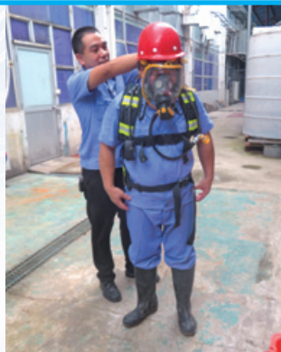
Safety Training and Drills 安全培訓與演練