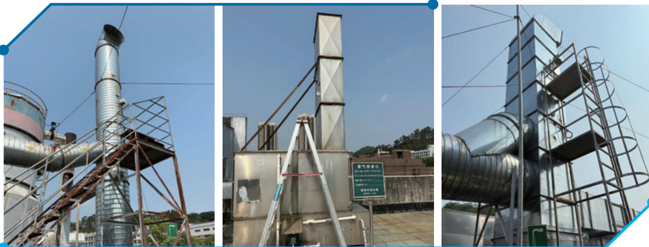
Exhaust Air Treatment Facilities 廢氣處理設施

本集團根據環境管理系統制定了「污染物管理程序」，生產設備與廢氣處理設施的操作人員必須完成專業培訓才可上崗工作，培訓內容包括操作和保養設施與設備的規定、預防和處理異常情況的具體方法等，員工須嚴格按照指引操作設備與設施，以防止因操作錯誤而引致廢氣洩漏或超標排放。此外，為了防止產生新的廢氣污染源，於購置新設備前，採購部會調查有關供應商，以及評估新設備所產生廢氣的主要成分及排放量是否符合國家的廢氣排放標準。