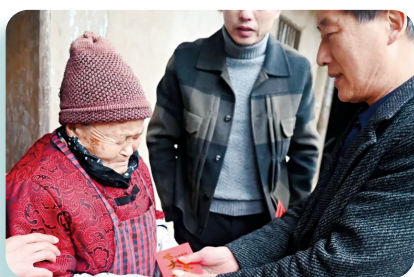
Consolation for Huanxi households in need

Giving back to the community has always been a part of the Group's development objectives. During the reporting period, we focused on community engagement in health, education, poverty alleviation and care for the elderly, donating a total of over RMB1.3 million, including donations through the Sijia Foundation. We also donated supplies to frontline medical staff in epidemic prevention, supplies and scholarships to kindergartens, primary and secondary schools and universities, poverty relief funds for rural areas and poverty-stricken districts, and consolation money and gifts for the elderly in the community during the holidays. We also encourage our staff to volunteer their time and skills to care for the community.