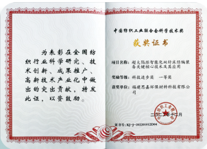
The First Prize of the Science & Technology Award of the Technology Progress of China National Textile & Apparel Council (中國紡織工業聯合會)