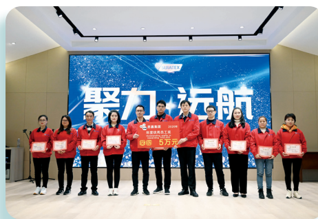
Recognition of outstanding employees of the Year