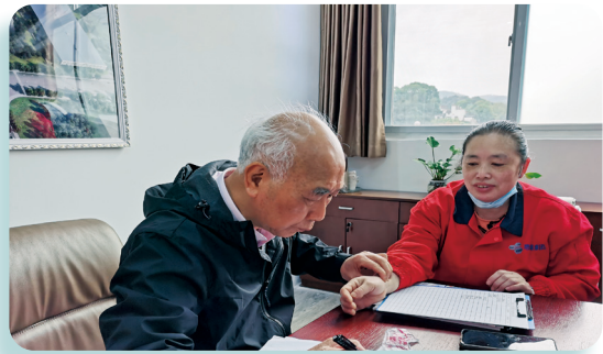
Staff consultation by health consultants