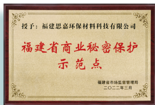
Fujian Province Demonstration Base of Business Secret Protection (福建省商業秘密保護示範點)