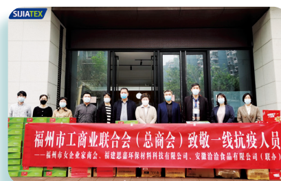
Donation of supplies for frontline workers in Fuzhou in epidemic prevention

In the future, the Group will continue to give back to the society through other means and will continue to pay attention to the economic and cultural development of the community, actively fulfilling its civic responsibility as a good corporate citizen and bringing positive impact to the society.