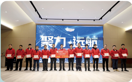
Smoking Cessation Award of the Year

In addition, we have established a smoke-free workplace policy which prohibits smoking in the Group’s workplace to protect the health of our employees. We have also established an annual smoking cessation award to encourage employees to quit smoking. During the reporting period, we also arranged for health consultants to consult with our employees. In the face of the challenges of the epidemic, the Group coordinated work schedules for staff in a reasonable manner, arranged them to work at home to minimise the risk of infection, and distributed epidemic prevention materials to them.