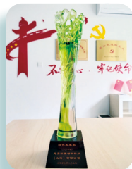
Green Development Award (綠色發展獎)