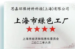
The Shanghai Green Factory