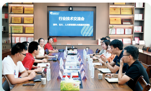
Industry technology exchange sessions R&D teams from Tsinghua University, Peking University and Renmin University of China and Sijia R&D Team

In addition, the Group supports its staff to attend seminars, sharing sessions and relevant courses organised by professional organisations through various incentives such as examination leave and cash subsidies, thereby actively encouraging our staff to pursue continuous learning and further education to enhance their professional skills and competitiveness.