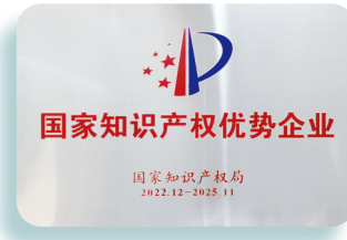
National Intellectual Property Advantage Enterprise