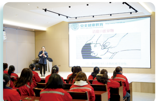
First aid safety seminar