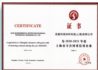
Shanghai Enterprise of Observing Contract and Valuing Credit (上海市守合同重信用企業)