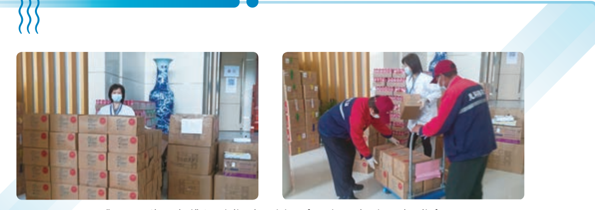
"Protect Shanghai" Specialized Activity of Anti-pandemic and Relief 「守護上海」抗疫濟困專項行動

During the pandemic, 5100 joined hands with the Shanghai Beauty Health Industry Association to join the "Protect Shanghai" specialized activity of anti-pandemic and relief to provide much-needed supplies to the frontline staff of the Fudan University Paediatric Hospital and delivered Tibet 5100 glacier mineral water to the frontline staff working on the anti-pandemic.