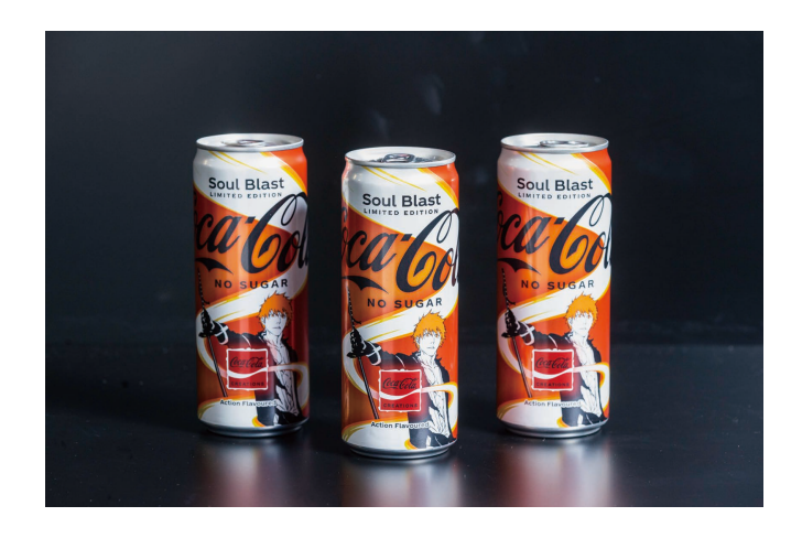
Coca-Cola Zero Sugar Blast x BLEACH: The Thousand Year Blood War Arc

Different events and pop up stores were launched in different regions with large exposures. We have Jujutsu Kaisen pop up stores at LCX and K11, Sesame Street mall event and crossover art exhibition with Jon Burgerman at Harbour City in Hong Kong, Baby Shark event in Indonesia, My Hero Academia & Haikyu pop up store in Taiwan.