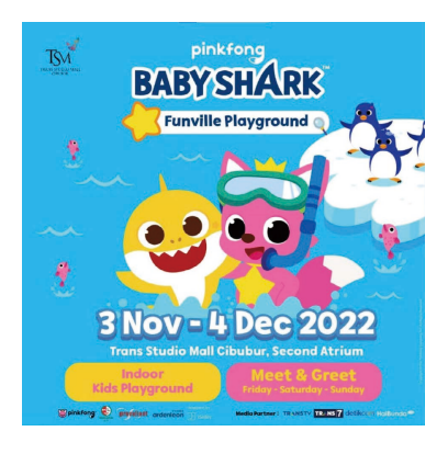
Baby Shark event in Indonesia