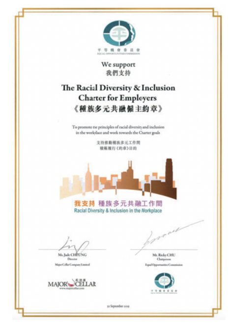
Certification of The Racial Diversity & Inclusion Charter for Employers

The Group's equal opportunities code specified under the Staff Handbook allows zero tolerance to any workplace discrimination, harassment or victimisation in accordance to relevant government legislation, ordinances and regulations. Employees are encouraged to report any incidents involving discrimination to the Audit Committee of the Board of the Group. We strive to ensure that complaints, grievances and concerns, including whistle-blowing, are dealt in a prompt and confidential manner.