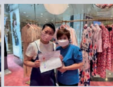
(Service and sales training)