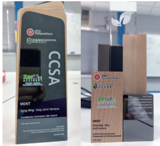
Considerate Contractors Site Award

The Group's efforts have been recognised by awards and recognitions. One of the JVs has managed to obtain the Considerate Contractors Site Award and Outstanding Environmental Management & Performance Award during the Reporting Period.