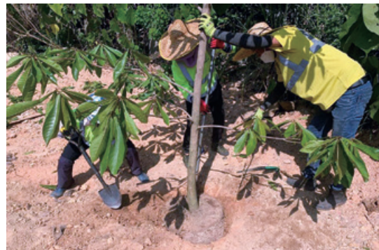
Tree planting at project sites

The Group has carried out tree planting during the Reporting Period at some of the project sites for the purpose of vegetation restoration.