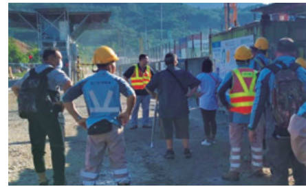
Safety trainings at project site

Mandatory basic safety training (Green Card) are ensured for all site workers. We also provide regular site health and safety trainings including safety induction training, toolbox talks, and specific health and safety training designed by the safety officer.