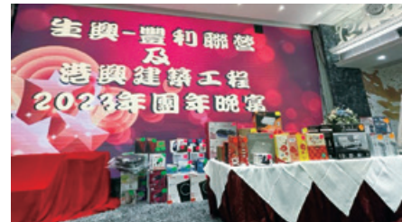
Lucky draw in Annual Dinner