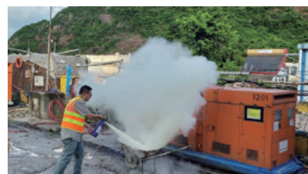
Fire drills at project site

According to the Group’s fire arrangements stated on Work Instruction, fire drill shall be conducted at least every six months. After each drill, meeting comprising of all responsible parties shall be held to review every aspect and improvement plans are established if necessary.