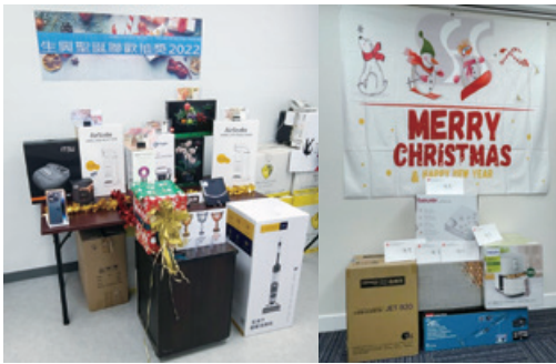
Lucky draw in Christmas Party

As COVID-19 was running rampant during the Reporting Period, the Group has limited its employee activities to mitigate the risk of virus transmission. Given that the implementation of appropriate preventive measures of COVID-19 as a priority, we have organised a variety of activities to motivate and to express gratitude towards employees for their effort and commitment, employee activities included Christmas party and annual dinner have been held.