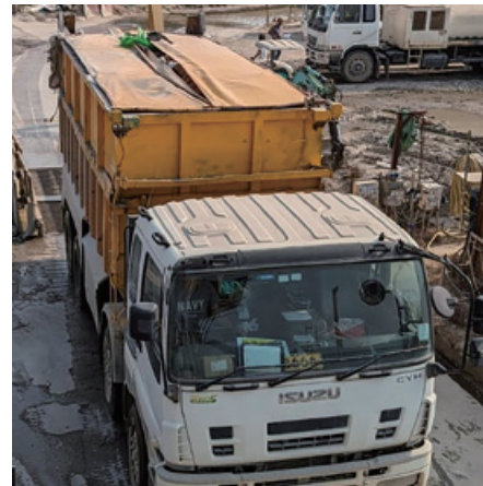
Dump truck that equipped with mechanical cover