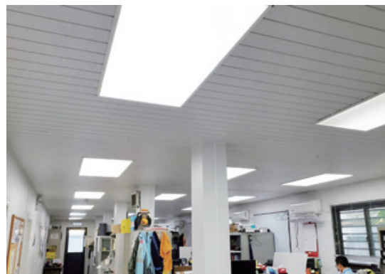
Energy saving lightings (LED lightings) are installed in site office