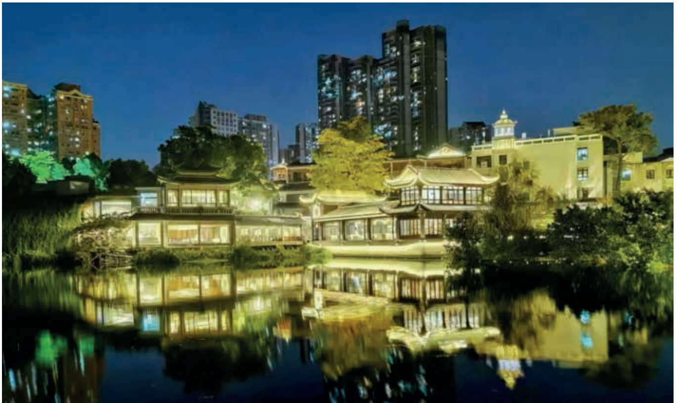
Night view of Panxi Restaurant in Guangzhou 廣州泮溪酒家夜景

集團經營的食品零售店，例如「零食物語」日本零食專門店及「宮田商店」等，現在除了銷售糖果及小食外，更受惠於集團於食品代理業務開關的民生食品代理業務，增加了銷售日本雞蛋、日本牛奶、「井村屋」豆腐和日本米等民生食品，吸引更多消費者長期光顧，擴闊了客戶群。