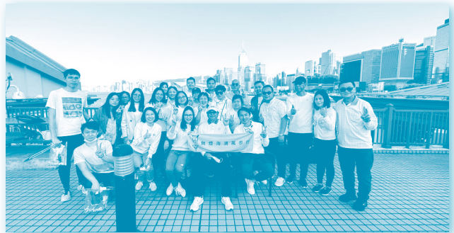
「無煙海濱萬步行」 Charity walk held in February 2023