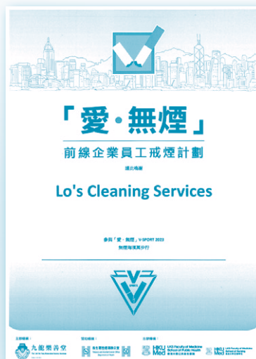
「無煙海濱萬步行」 Certificate of appreciation presented by Lok Sin Tong