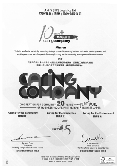
Figure 1: Certificate from Caring Company

The Group will continue to explore other means to contribute more to the environment and strive to facilitate the building of a healthy and sustainable society in the future.