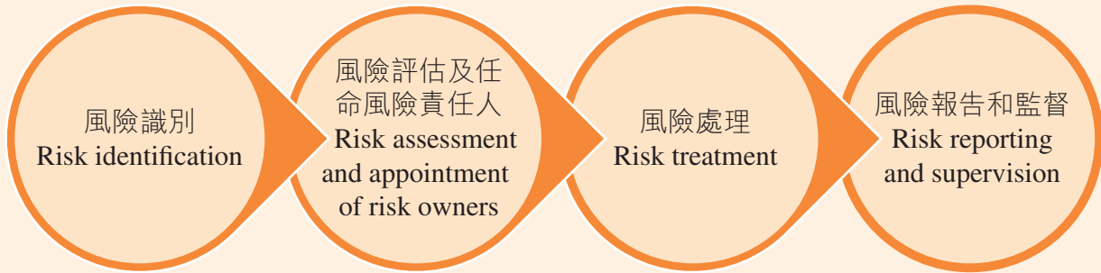
Risk Management Process Chart