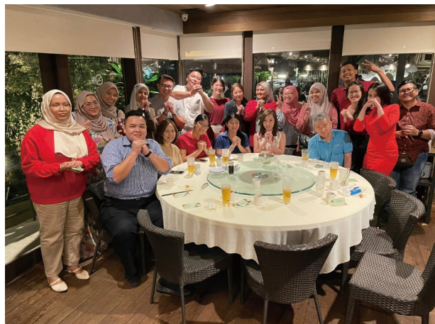
Employees gathering around during the Group's Chinese New Year dinner at South Sea Seafood Restaurant on 17 January 2023.

本集團志在確保員工有歸屬感，感到受欣賞及重視。通過本集團的人力資源部組織各種活動，以提供平台，讓員工能在愉快的環境中放鬆身心並相互聯繫。