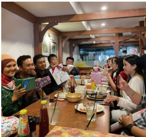
BGMC Group had organized a Christmas Luncheon and Secret Santa exchange gift on 15 December 2022 at Logenhaus Roast & Grill Restaurant.

The Group aims to ensure that its employees feel included, appreciated, and valued. Various activities have been organised via the Group's HR Department to provide platforms where employees were able to unwind and connect with each other amidst enjoyable environments.