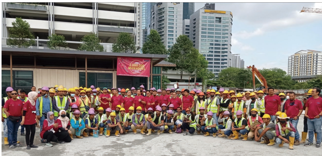
BGMC Project Bangsar 61 organised the Safety Campaign and celebrating the “2 Million Manhours without LTI” achievement at project site on 9 March 2023.

本集團遵守最新安全與衛生相關的法律和條規，包括但不限於《1994年馬來西亞職業安全與衛生法令》、《1967年馬來西亞工廠與機械法令》以及《1994年馬來西亞工業發展局(「CIDB」)法令》。該等合規措施包括為所有員工提供必要個人防護裝備，根據工作性質及工作環境的獨特性，組織關於良好工作場所安全與衛生習慣的培訓，組織工作場所關於符合人體工學的習慣和實踐的培訓，在辦公室和工地設立足夠的安全與衛生相關的告示牌，把其他組織的員工和工人包含在本集團的安全與健康計劃裡以提高計劃的效益，以及在辦公室和工地準備充足的急救箱。