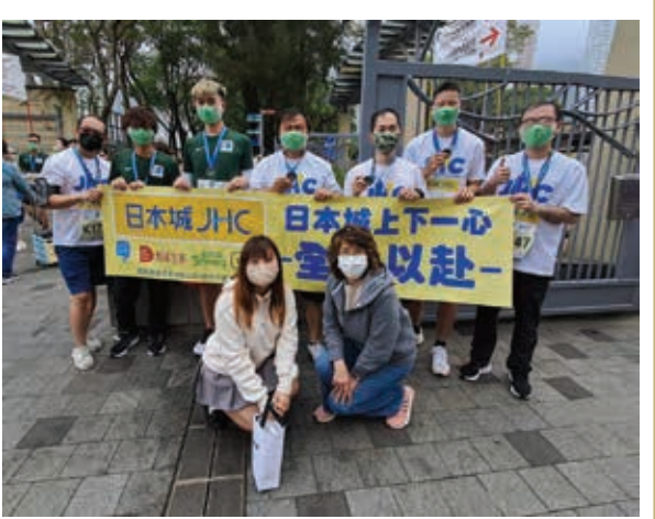
Our Group participated in Standard Chartered Hong Kong Marathon.