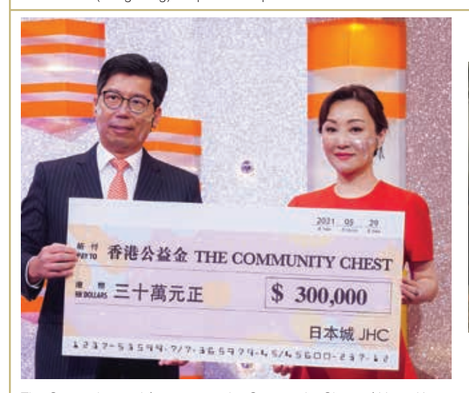
The Group donated $300,000 to the Community Chest of Hong Kong.