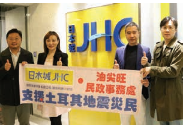
Our Group donated goods and materials and joined hands with Yau Tsim Mong District, Home Affairs Department to support the earthquake victims of Turkey.