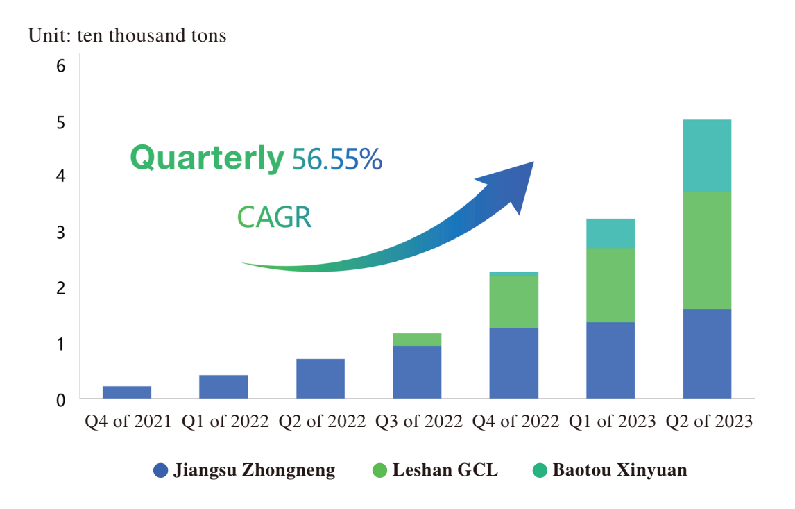
The quality concept of "exquisite craftsmanship, conscience quality" is deeply rooted, and the market demand for granular silicon exceeds expectations

Technology is the "first energy", and material is the "first cornerstone". In 2023, the change in the competitive landscape of the polysilicon industry accelerated. The Company further consolidated the development of "customer-centric, market-winning with quality", and unequivocally put forward the quality concept of "exquisite craftsmanship, conscience quality". The quality of granular silicon is improving, the customer loyalty continues to rise, and the growth in market share accelerates, helping to promote the industry's cost reduction and carbon emission reduction. As the photovoltaic industry has ushered in a new round of technological innovation in high-efficiency cells, TOPCon, HJT and other N-type cell technologies, with their latecomer technology advantages, sprang up with marked profitability premium. Obviously, 2023 was the first year of massive N-type cell production capacity expansion. Facing the high growth of N-type market, the shipment quantity and product quality of granular silicon which is more suitable for N-type applications, are improving, and the indexes such as minority carrier lifetime and unit yield will meet the needs of customers in all aspects.