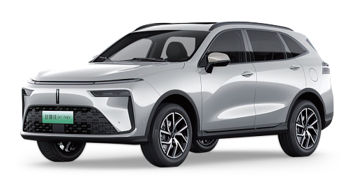
WEY New Latte

Positioned as a "popularizer of new energy off-road SUVs", Haval Raptor will comprehensively enhance the competitiveness of Haval brand in the new energy era, broaden its product layout of the Dragon series and strengthen its brand advantages; meanwhile it will also open up a new era to popularize new energy off-road vehicles and expand the niche market.