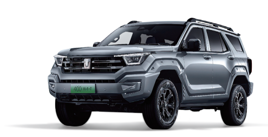
TANK 400 Hi4-T

As the second model developed by the TANK brand utilizing an off-road super hybrid architecture, Hi4-T, TANK 400 Hi4-T is positioned as a mid to large-size urban functional off-road SUV. With the design concept of urban functional aesthetics, Tank 400 Hi4-T pushes the design constraints of traditional mecha off-road vehicle to usher in a new style of metropolitan unconstraint by incorporating the urban geometric architecture and functional style into the vehicle body design. Supported by the exclusive architecture of professional core off-road and Hi4-T off-road new energy as well as characterized by technology assistance and safety protection, Tank 400 Hi4-T is pioneered to be an unbridled vehicle with a full range of functions that showcases unrestrained urban life.