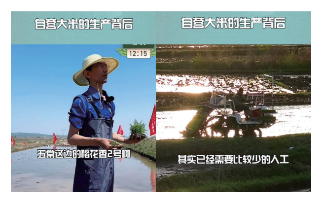
Wuchang Rice traceability