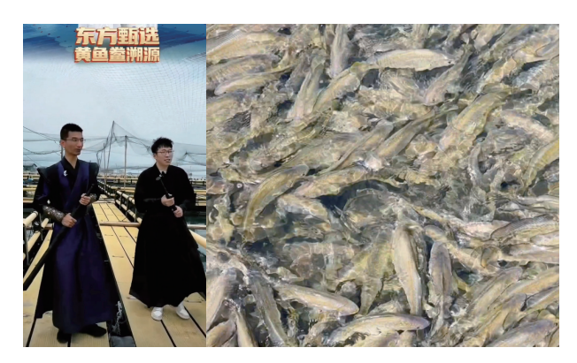
Dried Salted Yellow Croaker Traceability