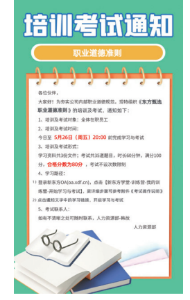
Occupational Ethics Examination of East Buy