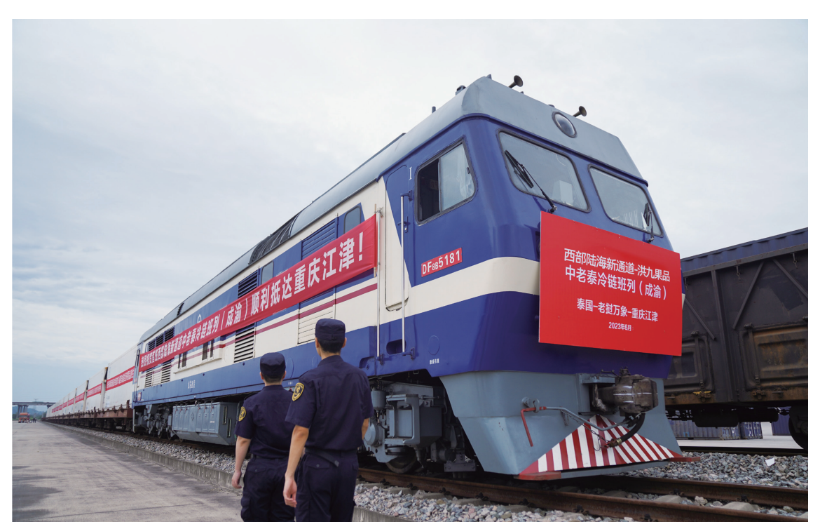
First trip of Hongjiu Thai Yummy cold-chain special train for durians

Compared with traditional sea and land transportation, the cold-chain special train effectively improves the transportation efficiency of fruit imported from the Southeast Asia, reduces the transportation cost and achieves cost reduction and efficiency improvement. Meanwhile, it can better ensure the freshness of fruit products and allow fruits from the Southeast Asia to enter the "fast lane" in China. With shorter time, higher quality and more favorable prices, it provides domestic consumers with better consumption experience and allows consumers to achieve "durian freedom". The opening of the trial cold-chain train lays market and operation foundations for its normalized opening in the future and is beneficial for the Company to continuously consolidate the advantages of its end-to-end supply chain.