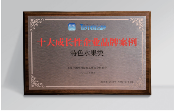
"Top 10 Brand Cases of Growth Enterprises in the Featured Fruit Industry" Certificate