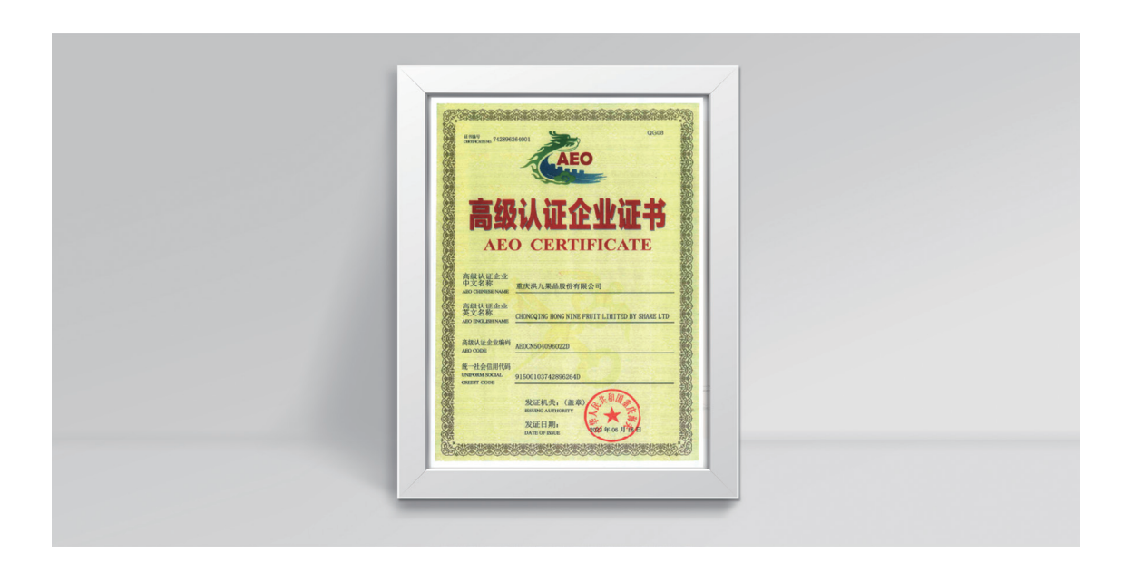
AEO Advanced Certificate