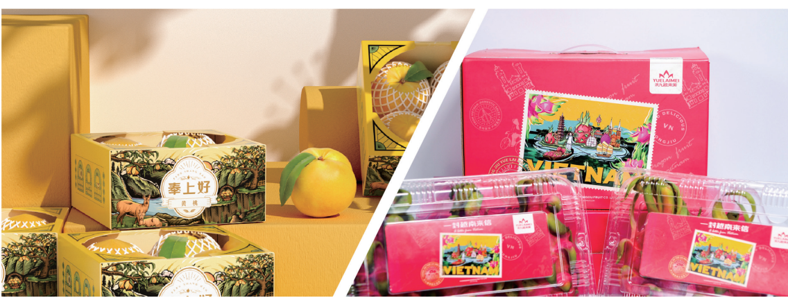
Scene and outer packaging of core brands