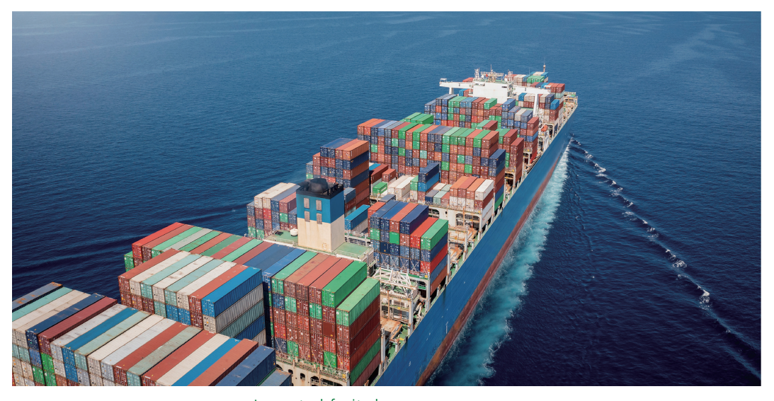
Imported fruits by sea