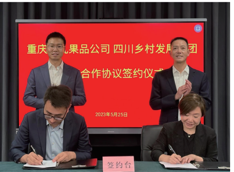
Signing ceremony of cooperative projects with governments in the premium places of origin of domestic fruits