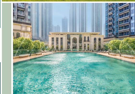
Manor Hill (Hong Kong) 海茵莊園(香港)