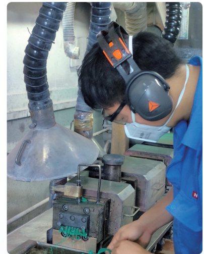
Protective supplies and noise reduction measures 勞動防護用品及減少噪音措施