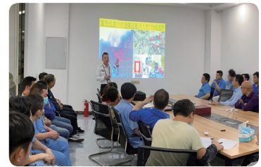
Fire prevention training and drill 消防培訓及演練