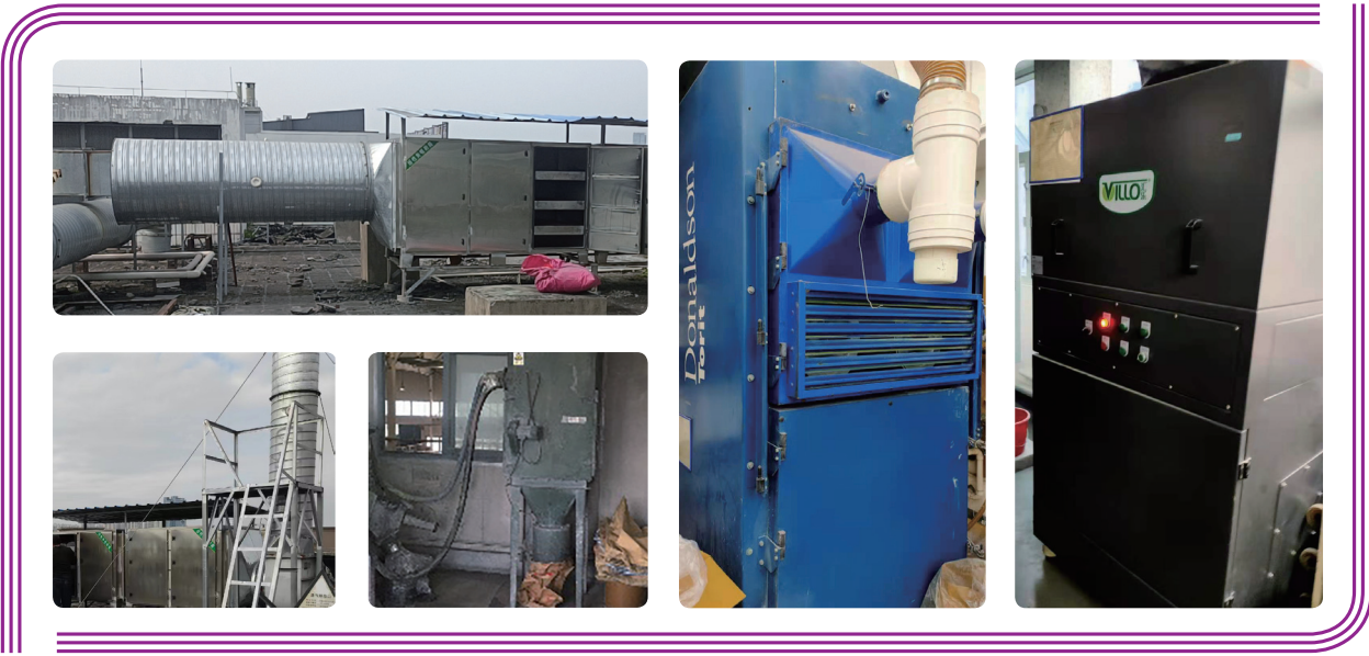
Exhaust air treatment facilities 廢氣處理設施

本集團於營運過程中所產生的廢氣主要包括非甲烷總烴 附註 、粉塵、顆粒物、車輛和叉車使用汽油及柴油時所產生的廢氣和溫室氣體，以及使用電力、液化石油氣、煤氣等能源時所產生的溫室氣體。本集團各部門各司其職，互相配合監控各個控制點，確保工業廢氣的排放符合國家標準。生產部主管督促生產部員工遵循生產工作指引、環保與生產設備的操作規程，確保環保與生產設備能同時有效地運作。