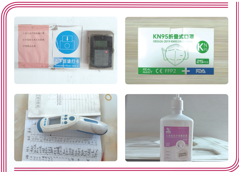
COVID-19 preventive measures 2019冠狀病毒病防疫措施

為了配合各地政府的防疫防控政策，普及各員工對2019冠狀病毒病的防控知識和提高自我防護意識和能力，本集團成立疫情防控小組，制定應急預案，準備疫情防護所需的資金與物資，實施有效的防控措施。雖然從去年12月開始，各地區的防疫強制措施逐步放寬或取消，但我們仍提醒員工注意個人衛生，多使用電子方式溝通及保持安全社交距離，防止疫情再次爆發。