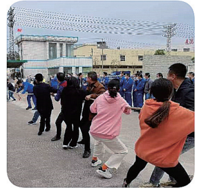
Employee activity 員工活動