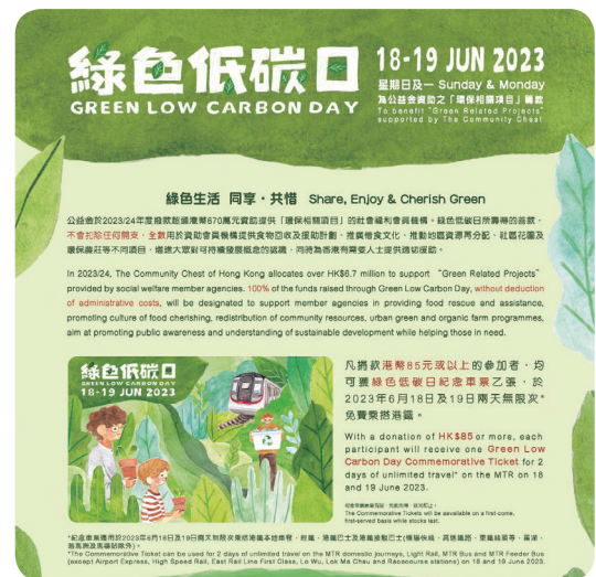
Participated in charities 參與公益活動