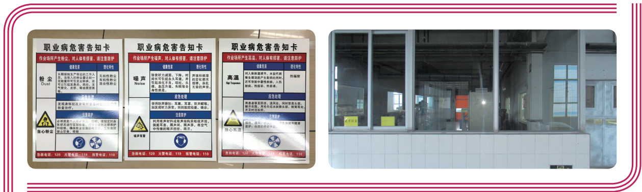
Occupational hazard notification card and enclosed workshops

在生產環境方面，由於大部分生產工序是於密閉式車間進行，為保障有關員工的健康及安全，我們於有關車間設有通風管道，使空氣流通，有效地改善車間內的空氣質素，為員工提供一個更健康、舒適的生產環境。我們於生產車間張貼職業病危害告知卡，以時刻提醒及警告員工各類危害源及相關的防範措施。維修部門負責檢查、維修及保養生產設備、機器、消防設施及防護器材，定期對隱患進行整改，保證設備處於良好狀態。