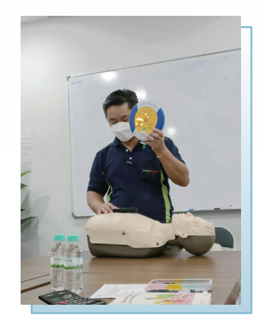
Automated External Defibrillator Training