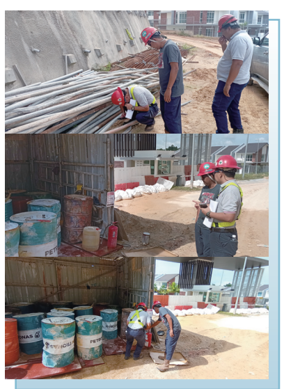
Slope Slippage Prevention – Inspection and Prevention