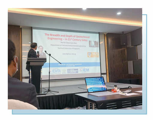
Geotechnical Engineering Training