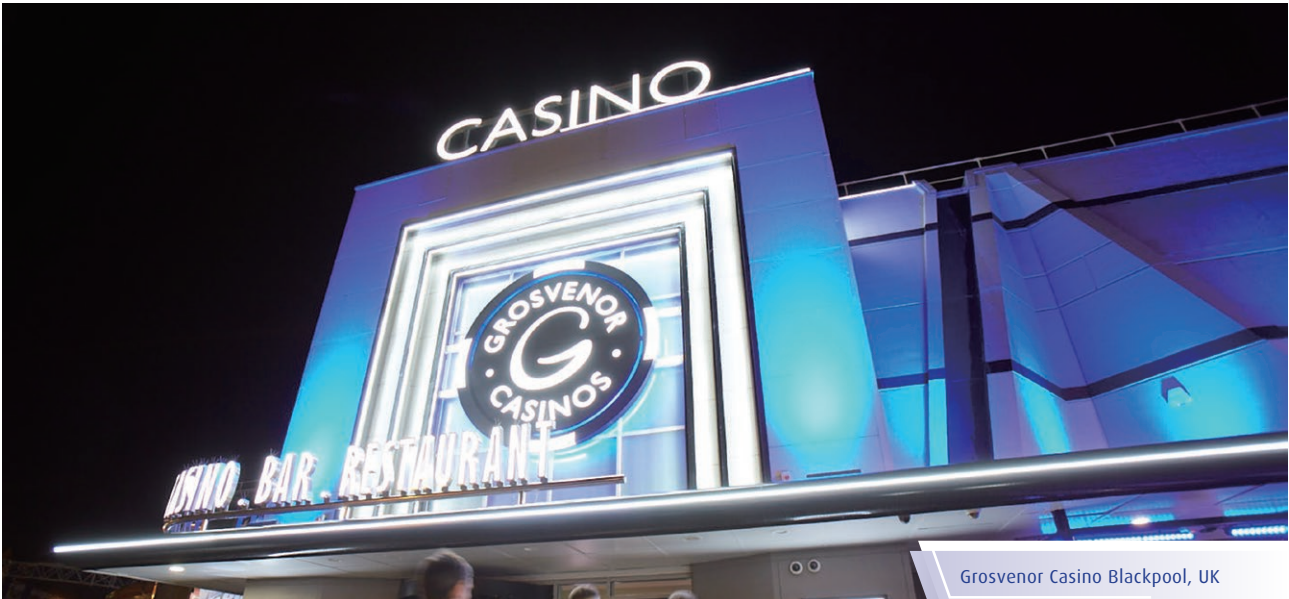
Grosvenor Casino Blackpool, UK

The digital business continued to perform strongly. The Mecca and Grosvenor brands are now fully operating on the RIDE platform and continued to improve their performance. The digital team is now focused on further improving the products, services and user experience for customers. Much greater personalisation has been added to the Mecca and Grosvenor sites and new live gaming tables have been added during the year. Safer gambling player journeys continue to be improved in order to help identify at risk play in real time. Similarly, in the Spanish facing digital business, YoSports was successfully launched in September 2022 in readiness for the FIFA World Cup, receiving a very positive reaction from customers.