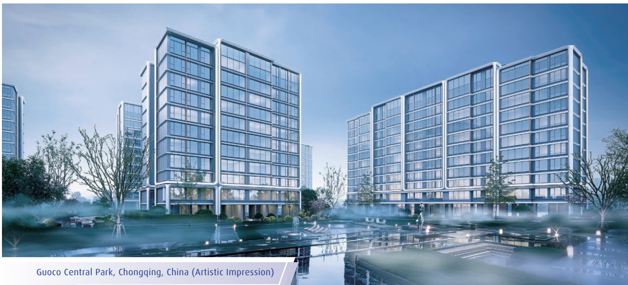
Guoco Central Park, Chongqing, China (Artistic Impression)

In Singapore, 17,484 units remained unsold in the non-landed private residential housing market at the end of the second quarter of 2023, up from 16,252 units at the end of the first quarter. With new project launches planned for the second half of 2023 and the Government Land Sales programme, supply will be further increased. Furthermore, the latest property cooling measures and the high interest rate environment are expected to moderate demand from investors and foreign buyers and therefore overall price appreciation. Official estimates indicate rental growth for office in the Central Region moderated in the second quarter of 2023. Strong leasing activities have mainly focused on prime Grade A offices. However, office rental growth is likely to be impacted by the uncertain economic outlook and higher interest rates.