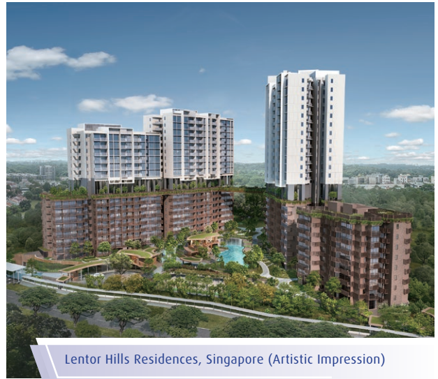
Lentor Hills Residences, Singapore (Artistic Impression)

In Malaysia, economic growth moderated to 2.9% in the second quarter of 2023 and is expected continue to grow at a slower pace for the whole year, amid the challenging global environment. The domestic property sector remains challenging mainly due to an overhang of excess property inventory in the residential and commercial market as well as other traditional property classes.