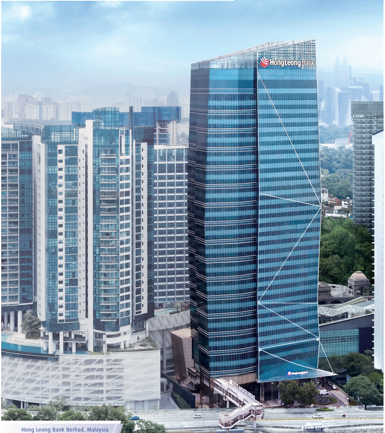
Hong Leong Bank Berhad, Malaysia