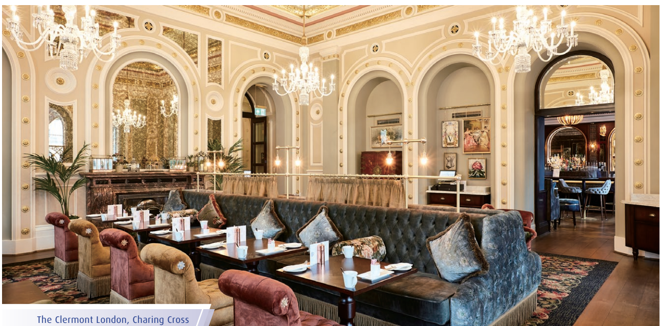
The Clermont London, Charing Cross