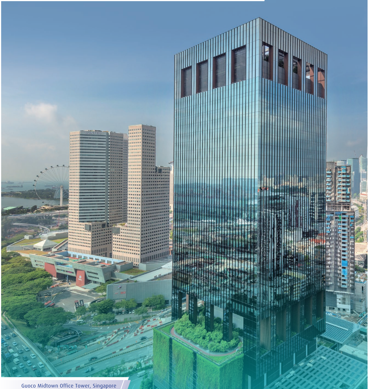
Guoco Midtown Office Tower, Singapore