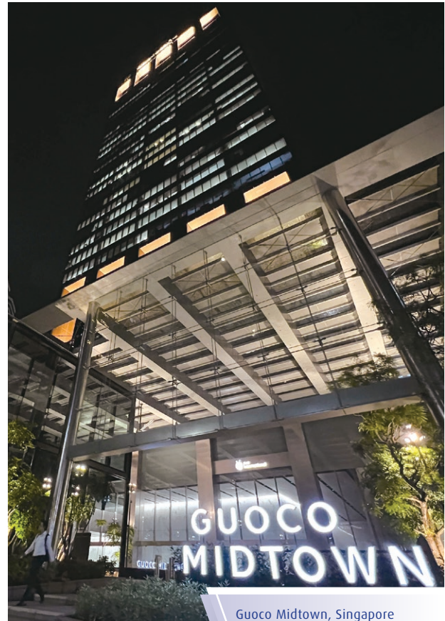
Guoco Midtown, Singapore

Revenue from GuocoLand’s investment properties increased by 35% to S$169.6 million (approximately HK$974.1 million) supported by higher recurring rental income from Guoco Tower, Guoco Changfeng City South Tower in Shanghai and the initial contribution from Guoco Midtown Office, which commenced operations in the second half of the financial year. In addition, revenue from GuocoLand’s hotels, especially Sofitel Singapore City Centre, doubled to S$68.7 million (approximately HK$394.6 million) as compared to the prior year.