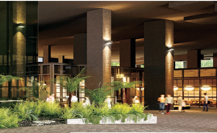
Midtown Modern, Singapore (Artistic Impression)

In China, the economy grew at 0.8% in the second quarter of 2023, slowing from the 2.2% expansion in the first quarter. The official growth target of around 5% for the full year remained unchanged but private sector economists have lowered their forecasts. Meanwhile, the property market contracted in the second quarter of 2023 after expanding in the first quarter. In order to improve market sentiment, policymakers have introduced various measures to support developers and home buyers.