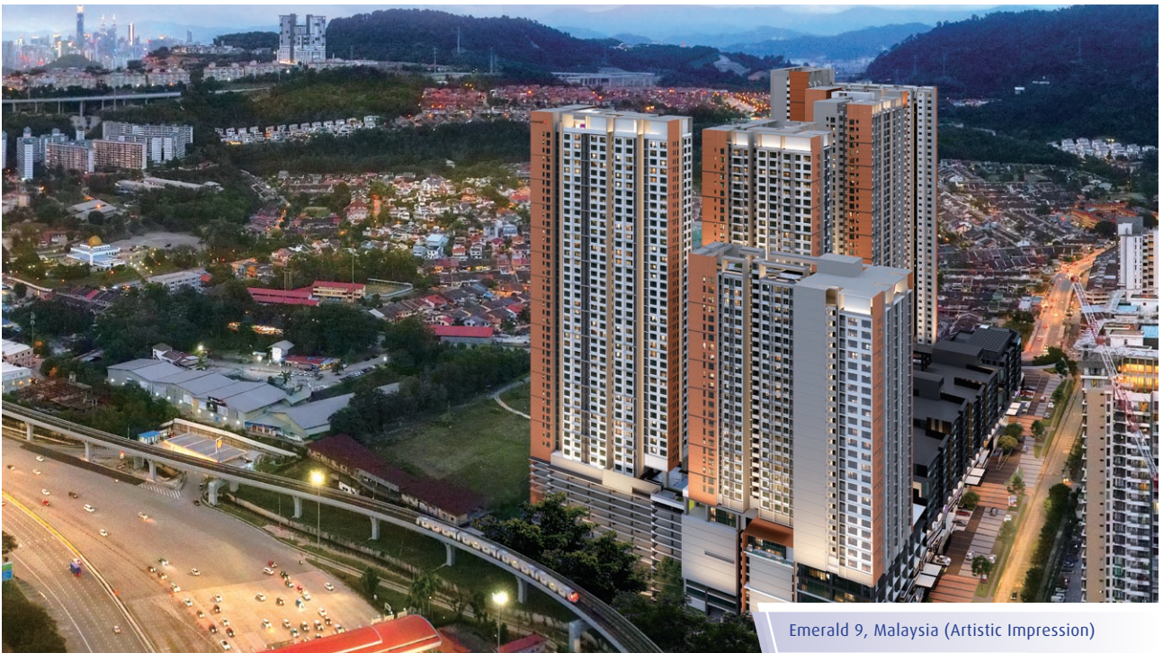
Emerald 9, Malaysia (Artistic Impression)