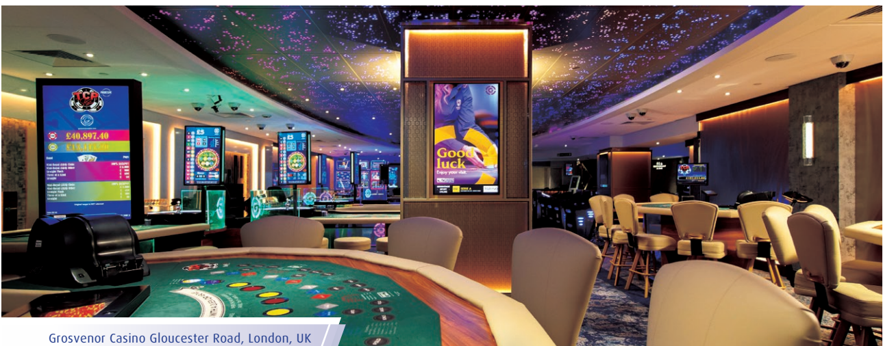
Grosvenor Casino Gloucester Road, London, UK