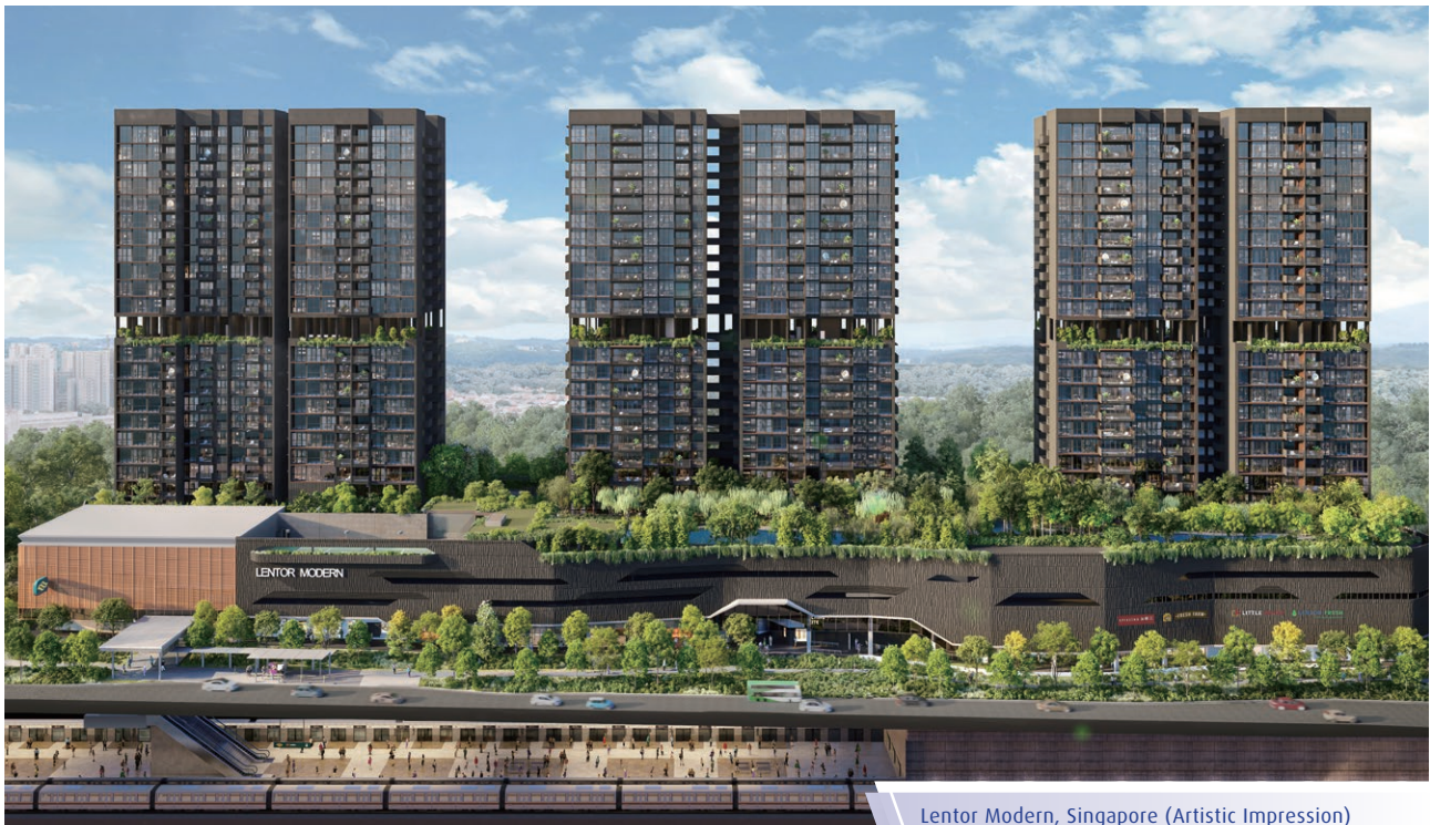
Lentor Modern, Singapore (Artistic Impression)