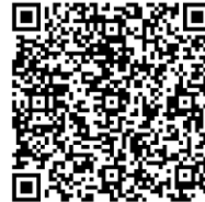
QR Code for download of the Request Form