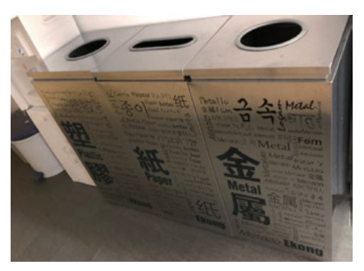
Waste categorisation: installation of different types of waste collection bins 垃圾分類:設置不同類別收垃圾箱

As a part of our environmental management, we endeavour to promote waste reduction and recycling at our subsidiaries, sports venues, retail outlets, offices and warehouses. We have formulated internal policies such as "Waste Reduction Targets and Measures to Take" and "Environmental Hygiene Management Regulations" to categorise, collect and manage solid waste within the Group, which is collected and disposed of by professional organisations.