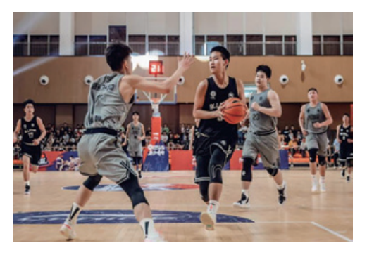
CJBL China Secondary School Basketball League All Star Game CJBL中國初中籃球聯賽全明星賽