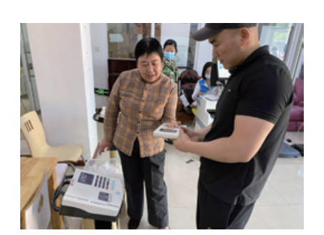
National Physical Fitness Monitoring in Jiangoutou (尖溝頭) community activity 國民體質監測走進尖溝頭社區活動