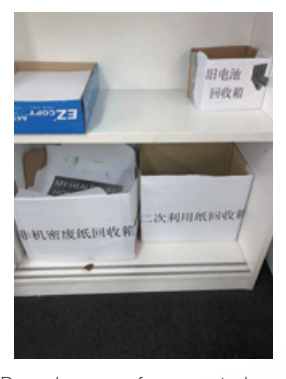
Recycle paper for repeated use 回收紙張,二次利用

作為我們環境管理的一部分,我們致力於在附屬公司、運動場所、零售店、辦公室和倉庫推廣減少廢物和回收利用。我們制定了《減少廢棄物的目標及所採取的措施》《環境衛生管理辦法》等內部政策,對本集團內的固體廢棄物進行分類、收集和管理,並由專業機構進行收集和處置。