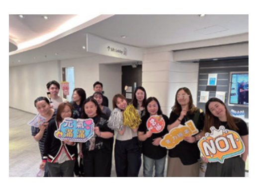
Sports Challenge Day 運動挑戰日