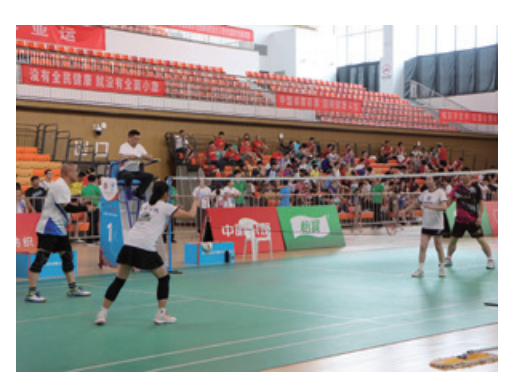
2023 Chinese Badminton Association Amateur Club League Tongxiang Regional Competition 2023年中國羽毛球協會業餘俱樂部聯賽桐鄉大區賽