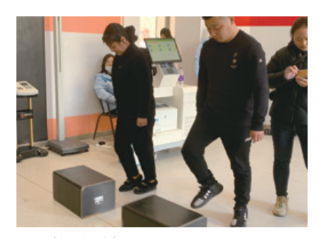
National Physical Fitness Monitoring in Jing Hai (靜海府) 國民體質監測走進靜海府