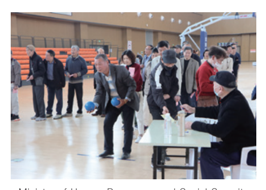
Ministry of Human Resources and Social Security Senior Cadre Activity 人社局老幹部活動

The foundation of health for all is comprehensive fitness. During the Reporting Period, the Group actively participated in the Hefei 2023 Swimming Training Subsidy Policy for Primary and Secondary School Students, with a total of 472 participants. We insisted on strengthening youth sports, with the main objective of teaching primary and secondary school students swimming skills and improving their physical fitness. At the same time, through the provision of swimming training subsidy for primary and secondary students, we encourage parents to bring their children to participate in swimming training.