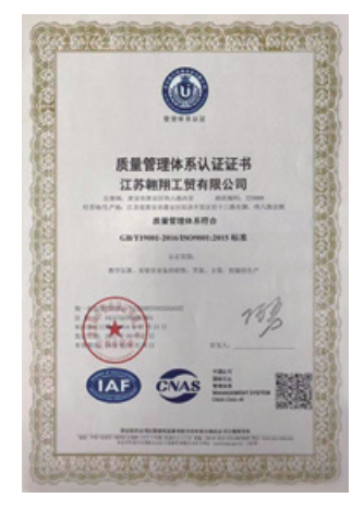
Bossini ISO 9001 QME Certificate Bossini ISO 9001 QME 誇書