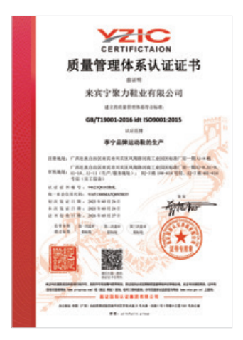
Laibin Ning Juli Shoes Company Limited ISO9001-QMS Certificate 來賓寧聚力鞋業有限公司ISO9001-QMS證書

In terms of product inspection, the Group has also formulated relevant internal policies and documents to safeguard the quality of the products, including but not limited to the "Viva Goods - Quality Management System for Large Production Suppliers", "Product Processing and Customisation Agreement", "Inspection Report" and "After-sale Returns Procedure", etc., products are inspected, tested, approved and accepted by the Group before they are put into the warehouses. If the products fail to meet the inspection standards and quality requirements, we shall have the right to refuse to accept the products and refuse to pay for the unqualified products, and the supplier shall indemnify the Company for all the losses incurred. In the event of a quality problem for the products, the supplier shall organise a quality meeting with the relevant personnel to analyse the cause of the failure and complete an analysis report, and cooperate with us to implement necessary remedial measures to rectify the problem. During the Reporting Period, there was no product recall for safety and quality reasons in the reporting business scope.