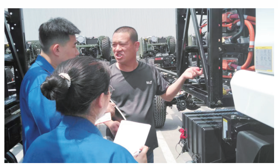
End User Satisfaction Survey