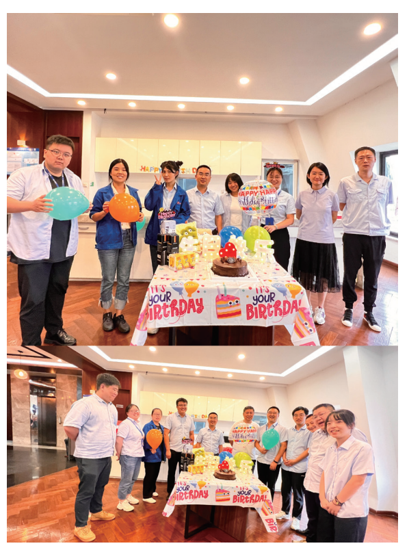
Employee Birthday Parties

In addition, the Group distributes festive welfare (such as food and daily necessities) to employees on festivals such as the Spring Festival, Dragon Boat Festival, Mid-Autumn Festival and National Day, and organizes festive activities such as the 2023 Lantern Festival, which not only enriches the cultural life of employees, but also deepens the employees' understanding of traditional culture. The Group also organizes leisure activities such as flower arrangement class, wagashi making, drawing manga etc., to help employees relax after a stressful day at work. The Group has always cared for its employees, and often arrange condolence and consolation sessions during festivals and weather changes bringing coolness in summer and warmth in winter, in order to enrich the cultural life of employees, let employees feel the warmth of the Group, and enhance the happiness index of employees.