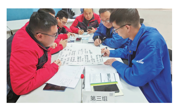
Warehouse Cost Control Training

In order to cater for the training of different employees development directions, the Group has formulated various types of training, allowing employees to make full use of both working and after-work hours to learn basic knowledge, skills, and advanced expertise, thus improving themselves and learning efficiency. During the Year, the Group had provided job-related trainings for employees such as data analysis including using programming languages Python and Java, industrial procurement management, business optimization and development, cost analysis, quality system, on-site management, sales, and much more to be listed. In addition, the Group also provides new introductory trainings for new employees, including general knowledge training upon entry and pre-job training to accelerate the performance of new employees and their business skills set.