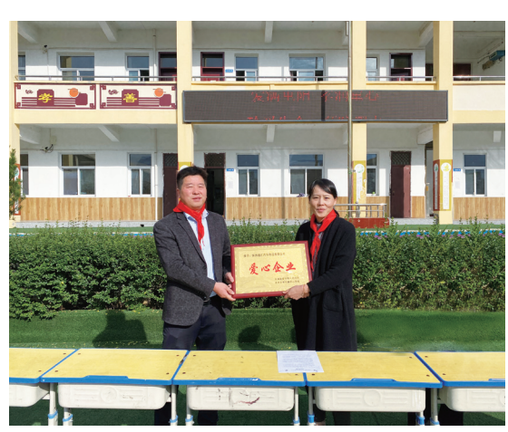
Sending Appreciation Award