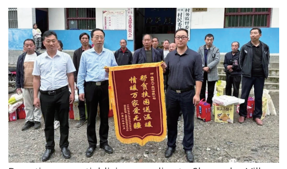
Donating essential living supplies to Shuanghe Village

On June 17, 2023, in Shuanghe Village, Zhen'an County, Shangluo, the Group organized a charitable activity named "Support for Rural Revitalization and Loving Donation." This activity focused on supporting 20 local households in need. The Group's employees actively participated and donated essential living supplies worth a total of RMB12,000, including rice, flour, oil, and other basic necessities, to help improve their living conditions. This charitable activity demonstrates the group's support for rural revitalization and care for people in need.