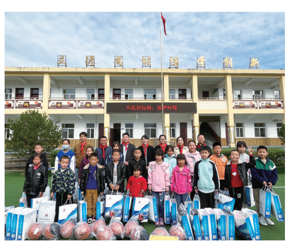
Distribution of Materials

On October 21, 2023, at the Central School of Pu Hua Town, Lantian County, a special charity activity brought warmth and care to 25 children. During the activity, the children received well-prepared duvets, stationery gift boxes, and basketballs by the Group, with the total value of these materials reaching RMB8,813. All donated items were distributed on-site directly, ensuring that the materials could be delivered to the children timely and accurately, to support their studies and daily life, while also conveying the warmth and care of society.