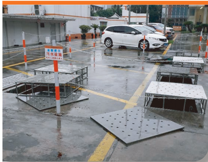
Picture of the sewage sedimentation tank (left) and the sewage facility (right)