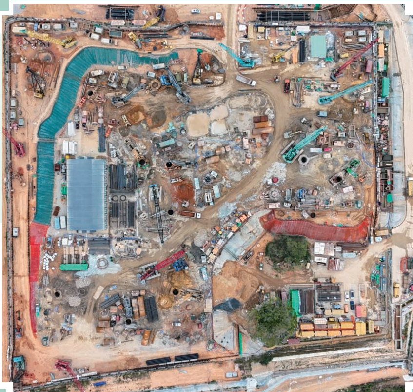
Design and Construction of Public Housing Development at Kwu Tung North Area 19 Phase 2