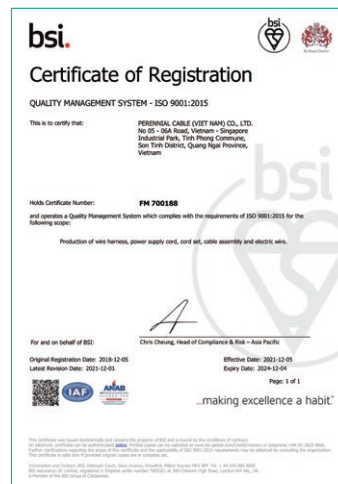
ISO 9001: 2015 Certificate in Vietnam ISO 9001 : 2015越南證書