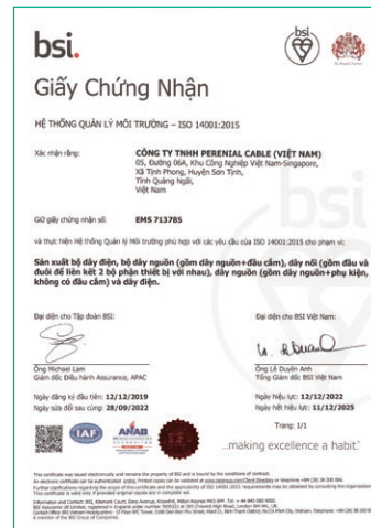
ISO 14001: 2015 Certificate in Vietnam ISO 14001 : 2015越南證書