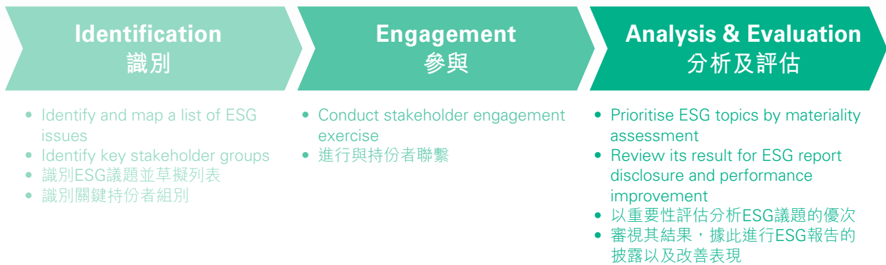
Materiality Matrix 重要性矩陣

為識別對本集團而言至關重要的ESG議題，以便為ESG管理制定適當的ESG策略，以及界定本報告方向，本集團已委託一間獨立顧問公司以線上問卷的形式進行重要性評估。我們邀請關鍵持份者組別（例如董事會、員工、客戶及供應商）填寫問卷，評估二十二項已識別的ESG議題與本集團業務營運及持份者本身的重要性，並據此分別進行評分。