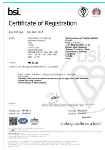
ISO 9001: 2015 Certificate in PRC ISO 9001 : 2015中國證書

本集團承諾為客戶提供高品質、安全的產品。本集團位於中國及越南的生產現場已落實嚴格的內部品質控制程序，並均已通過ISO 9001品質管理體系認證，監控整個生產過程及產品質量，包括確保產品的一致性，預防和糾正不符合規範的產品。本集團亦會對所有產品進行全面品質檢驗，只有通過檢驗的產品才能進入下一道工序。而在原材料管理方面，本集團要求所有產品的原材料必須符合相關的產品安全和環境要求(如RoHS)。例如，產品只使用銅含量在99.96%以上的銅線作為原料，以保證具有較高的能源效益。藉由嚴格的產品質量控制，本集團的產品質量得到了不同國家客戶的認可。