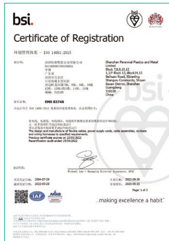
ISO 14001: 2015 Certificate in PRC ISO 14001 : 2015中國證書

為減少營運對環境造成直接影響，本集團在中國及越南分別落實了《環境污染防治控制程序》及《職業健康安全與環境政策》，以控制營運過程中產生的廢水、廢氣、噪音及廢棄物，使本集團的環境表現符合中國及越南環保法規的規定。此外，本集團在中國及越南的生產現場的環境管理系統已獲得ISO 14001認證。