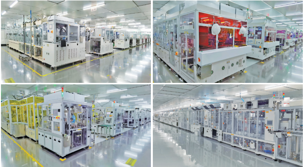
Integrated fully automatic inline production lines