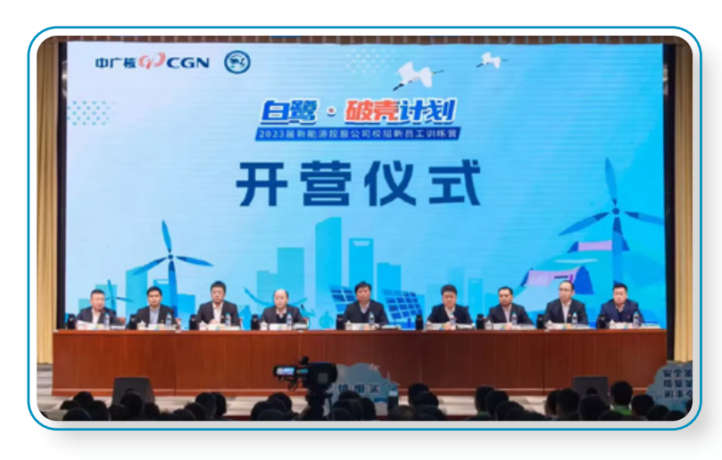
The opening ceremony of the "Egret-Hatching Scheme"

During the Reporting Period, CGN New Energy held the "Egret-Hatching Scheme" training camp for new employees recruited from campus in 2023 to guide the future development of new employees through the design of diverse learning content.