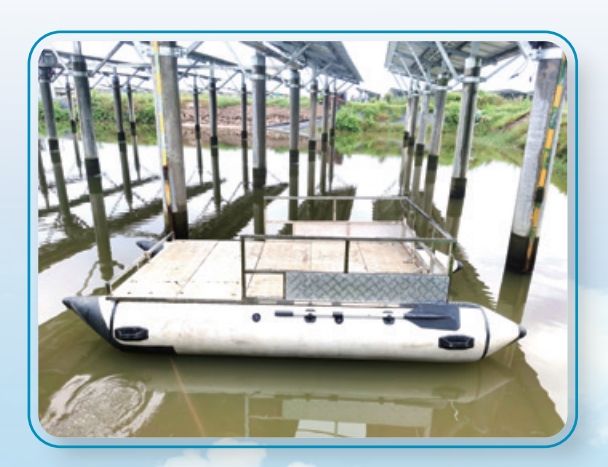
Floating photovoltaic working boat

The power station has undertaken several innovative transformation projects simultaneously, including the installation of box transformers for measurement and control, lightning arresters, rain covers for inverters, lightning rods at switching station, and lead under the transformation to mitigate safety risks and ensure operational safety.