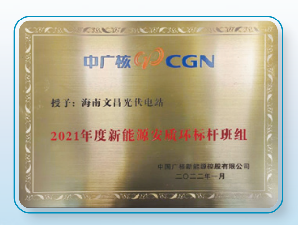
Won the "Safety, Quality and Environment Benchmarking Team"

Hainan Wenchang Liyang Photovoltaic Power Station has been awarded a number of honors since its commissioning, including the "Safety, Quality and Environment Benchmarking Team" of CNG New Energy in 2021, the "Excellent Quality Team" award and the "Safety, Quality and Environment Standardization second-level Unit" of CNG New Energy in 2023. At the same time, this Photovoltaic Power Station has also cultivated outstanding talents such as CGN new energy production operation and maintenance technical support experts and the seventh player in the "Safe Operation" skill competition. In addition, this Photovoltaic Power Station passed GB/T24001-2016/ISO14001:2015 Environmental Management System, GB/T45001-2022/ISO45001:2018 Occupational Health and Safety Management System, GB/T19001-2016/ISO9001:2015 Quality Management System Certification, and obtained the certificate.