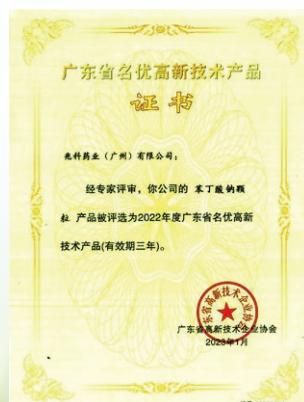
2022 Guangdong Famous High-tech Products Awards 2022年度廣東省名優高新技術產品

李氏大藥廠控股有限公司自主研發產品苯丁酸鈉顆粒《瑞本納平®》憑藉著突出的創新能力、先進的技術水準、可靠的品質和良好市場前景，榮獲「2022年度廣東省名優高新技術產品」。