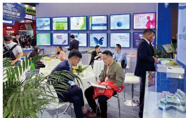
The 86 th PharmChina event 第86屆全國藥品交易會

On the other hand, the Group has successfully held The 8 th Pulmonary Arterial Hypertension Summit in Chongqing. With the theme of "Protecting Heart and Lungs For Health", the forum aimed to promote academic exchanges at home and abroad, and to improve the diagnosis and treatment of pulmonary arterial hypertension.