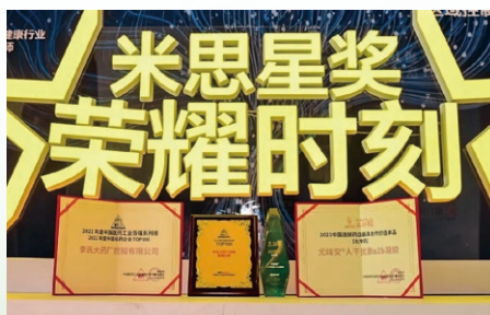
Misi Star Award 米思星獎

由業界權威醫療資訊平台米內網主辦的2023年米思會（中國醫藥健康產業共生大會）於湖州召開。李氏大藥廠連續4年榮登「中國化藥企業TOP100」，意味本集團在品牌佈局創新、服務領導性、策略前瞻性等方面皆處於行業領先地位。此為市場對本集團高品質、持續創新和強大發展實力的肯定。