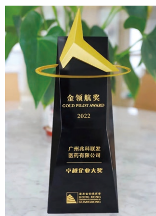
Excellence Enterprise Award 卓越企業大獎

The 2023 Misi Conference (2023 年米思會) (China Medical and Health Industry Symbiosis Conference) hosted by the industry’s authoritative medical information service platform Menet was held in Huzhou. Lee’s Pharm has won the “Top 100 Chinese Chemical Pharmaceutical Companies” for four consecutive years which means that the Group is in a leading position in the industry in terms of brand layout innovation, service leadership, and strategic foresight. It is the market’s affirmation of the Group’s high-quality continuous innovation and strong development strength.