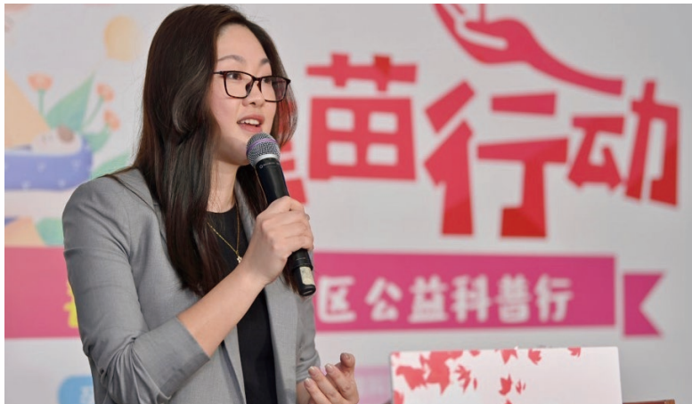
Public welfare activity of the Seedling Action 健苗行動公益活動

為響應健苗行動公益系列活動及白雲區三元里街道辦事處引領保護未成年人和婦女兒童健康高品質發展的具體舉措，誠邀南方醫科大學第三附屬醫院婦產科副主任醫師為三元里街道居民能做好婦女兒童保健工作進行知識分享並解答相關疑問。是次活動由廣州市白雲區民政局及廣州市白雲區婦女聯合會主導；並由廣州市白雲區三元里街道辦事處、廣州市白雲區未成年人保護協會、南方醫學網、廣東經濟科教頻道廣東社區中心及CSR環球主辦；三元里街社工站協辦，且獲本集團大力支持。