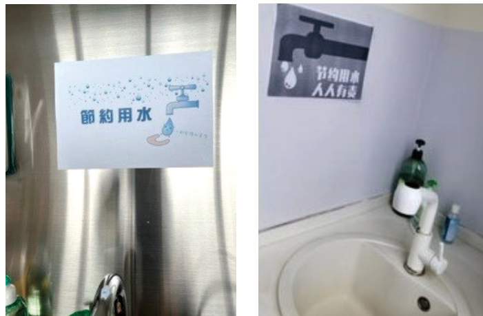
Water saving reminders 節約用水提示

水資源主要用於香港、中國內地和台灣辦公室的基本清潔、衛生和產品製造用途。現有的供水已滿足我們日常營運的需求，而水資源供應方面亦沒有問題。我們通過採取各種措施以節約用水。我們定期維護供水系統，以避免不必要的滲漏，並在顯眼的位置張貼節約用水提示，積極提高僱員節約用水的意識。