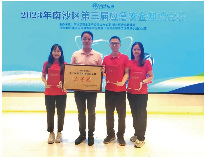
The third prize award of The 3 rd Emergency Safety Knowledge Contest 第三屆應急安全知識競賽三等獎