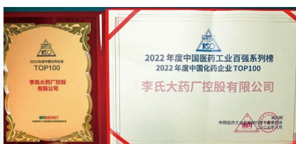
Top100 list of Chinese Chemical Pharmaceutical Companies 中國化藥企業TOP100