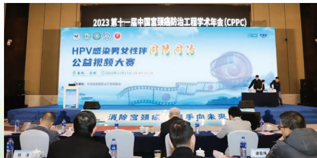
Prevention and Healing of HPV-infected Male and Female Sexual Partners HPV感染男女性伴同防同治

本集團認為與社區的聯繫對我們的品牌實力至關重要。為響應世界衛生組織加速消除子宮頸癌的全球倡議，本集團已落實「健康中國2030」目標並履行企業社會責任與義務。我們與中國宮頸癌防治工程組委會及婦幼健康研究會共同舉辦了「HPV感染男女性伴同防同治」及「生命早期1,000天鐵營養管理」影片推廣計劃。相關影片於李氏線上微信公眾號和李氏醫學發現網站兩個醫療公益平台上線。