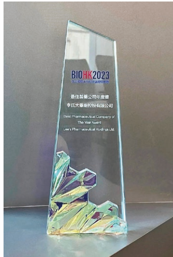
Best Pharmaceutical Company of the Year Award 最佳製藥公司年度獎

此外，李氏大藥廠繼續以白銀贊助商身份支持由香港生物科技協會主辦的香港國際生物科技論壇暨展覽，並榮獲「最佳製藥公司年度獎」，以表揚其對製藥業所作出的貢獻。