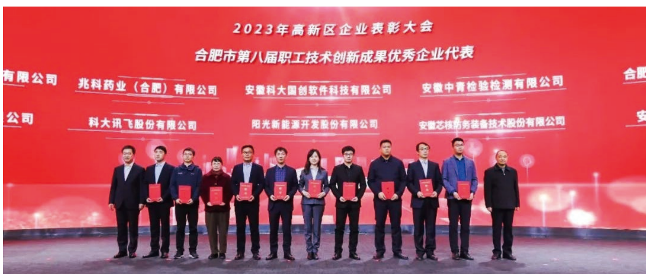
Second prize under the 8 th Hefei City Industrial Achievements in Technology and Innovation of the 2023 High-tech Industrial Development Zone Awards Ceremony 2023年高新區企業表彰大會合肥市第八屆職工技術創新成果優秀企業代表二等獎

職工技術創新成果獎項旨在激勵企業參與科技創新活動，促進企業技術及科技發展。由李氏大藥廠控股有限公司研發的抗血小板溶栓素項目榮獲2023年高新區企業表彰大會「合肥市第八屆職工技術創新成果」二等獎。