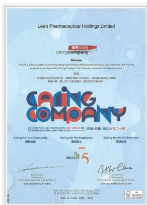
Caring Company Logo 「商界展關懷」榮譽標誌

本集團榮獲香港社會服務聯會「商界展關懷」計劃連續三年提名「關愛公司」標誌，以及中國宮頸癌防治工程組委會頒發的全國公益演講活動社會責任獎，上述獎項乃是對我們不斷努力和承擔企業社會責任的認可。