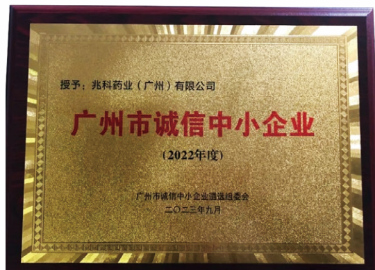
2022 Honest Small and Medium-sized Enterprise in Guangzhou 2022年度廣州市「誠信中小企業」

此外，根據於報告期內正式發佈的「2022年度廣州市「誠信中小企業」及「信用創新應用案例」評選結果，本公司之全資子公司兆科藥業(廣州)有限公司榮獲「2022年度廣州市「誠信中小企業」，以表揚其透過向中小企業宣揚誠信經營意識，致力創造正向營商環境的貢獻。