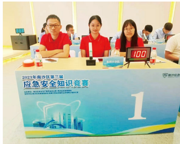
The 3 rd Emergency Safety Knowledge Contest 第三屆應急安全知識競賽

為體現本集團對僱員職業安全的高度重視並響應由廣州市南沙區安全生產委員會於南沙區舉辦的第三屆安全知識競賽通知，我們的安全及保安部已安排員工報名參賽並成功獲得三等獎。