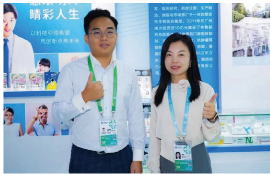
The 6 th China International Import Expo 第六屆中國國際進口博覽會

是次進博會，本集團不僅展出了腫瘤、心血管、婦科、皮膚科、罕見疾病等多種藥品，亦展出了從美國進口的最新一氧化氮治療裝置，該裝置將與呼吸機配合使用，用於治療肺動脈高壓、呼吸衰竭等疾病。中國國際進口博覽會乃促進合作實現互利共贏的平台。透過進博會，李氏大藥廠向更多人「曝光」，從而把握與新舊合作夥伴共享資源和技術的機會，並推動高水準開放合作。