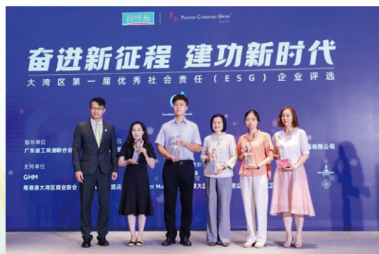
Most Popular (ESG) Company Award in the Greater Bay Area 大灣區最受歡迎(ESG)企業大獎

以外，李氏大藥廠亦榮獲由廣東省工商聯合會指導、羊城晚報報業集團旗下廣東新快報社及普卓顧問集團聯合舉辦「奮進新征程、建功新時代—大灣區第一屆優秀社會責任(ESG)企業評選」中的「大灣區最受歡迎(ESG)企業大獎」以表揚本集團為推動大灣區ESG發展所作出的貢獻。