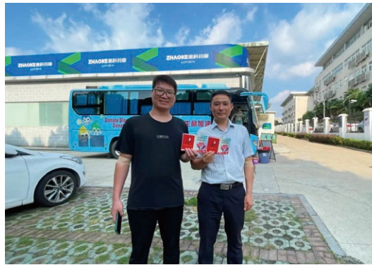
Blood Donation Event 無償捐血活動

多年來，我們一直支持各種慈善事業，並為弱勢社群提供援助。於報告期內，我們響應捐血車輛抵達的通知，參加了由其於合肥舉辦的捐血活動，旨在幫助緩解血庫儲存的壓力。我們有27名僱員參加了是次活動，他們對是次活動的參與和投入受到高度贊揚及感謝。