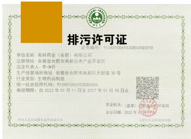
Pollutants Discharge Permit 排污許可證

本集團的生產和營運對環境的主要影響乃生產線的直接和間接溫室氣體排放以及用電情況。實施環境保護程序乃符合本集團的目標，因節省能源、水和其他原材料不僅環保，而且節省成本。本集團堅信上述舉措將有助於環境和本集團業務的可持續發展。除非在本報告中另有披露，否則本集團的經營活動對環境和自然資源沒有重大影響。我們亦已取得經營場所所在地環保部門所批核的排污許可證，保證我們的污染排放物對環境的影響降至最低。