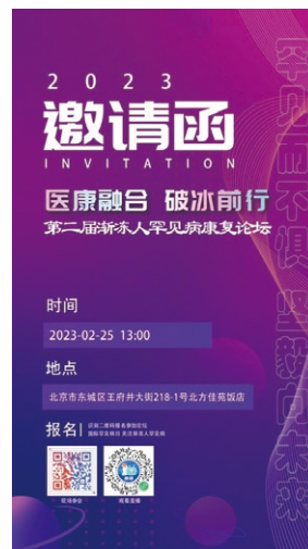
“Medical and Health Integration • Breaking the Ice” – The Second ALS Rare Disease Rehabilitation Forum 「醫康融合•破冰前行—第二屆漸凍人罕見病康復論壇」

為進一步強化醫藥與健康融合對ALS患者及其家屬的重要性，北京東方絲雨漸凍人罕見病關愛中心已於報告期內舉辦「醫康融合•破冰前行—第二屆漸凍人罕見病康復論壇」。本集團積極參與是次活動，透過在論壇上進行學術分享，聚焦ALS的精準診斷和治療策略，希望為ALS患者、家屬及相關人士提供更多的臨床應用選擇。該論壇誠邀診斷、治療、醫學、康復及相關領域的企業、專家和學者齊聚一堂，共同探討醫藥與健康融合的方法，幫助ALS患者獲得更好的生活質量，聚焦ALS診斷和治療、藥物可及性和復健護理。