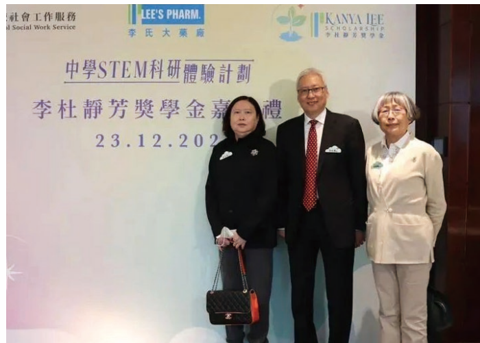
Kanya Lee Scholarship Award Ceremony 李杜靜芳獎學金嘉許禮

另一方面，於報告期內，本集團已向中國內地、澳洲及香港大學醫學系及／或研究藥物開發的研究生及博士生獎學金計劃捐款165萬港元以表達我們對年輕一代學習和發展的支持。報告期內共有11位得獎者獲得獎學金。