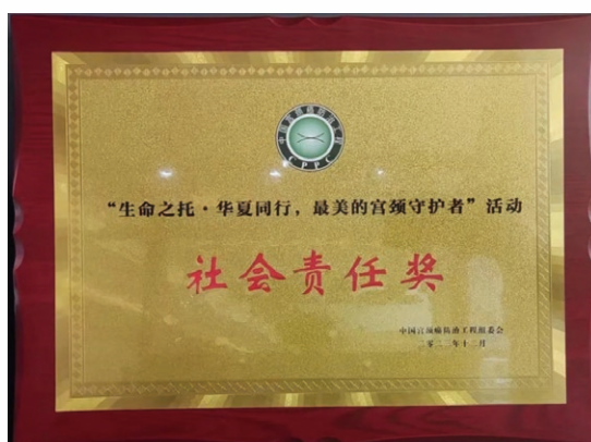
Social Responsibility Award 社會責任獎

Also, Lee's Pharm has also won the "Most Popular (ESG) Company Award in the Greater Bay Area" in the "Forge Ahead on a New Journey, Make Contributions to a New Era" – The First Excellent Social Responsibility (ESG) Enterprise Selection in the Greater Bay Area (「奮進新征程、建功新時代—大灣區第一屆優秀社會責任(ESG)企業評選」) jointly organised by the Guangdong Federation of Industry and Commerce (廣東省工商聯合會指導), Guangdong New Express Press (廣東新快報社), which is under the management of Yangcheng Evening News Group (羊城晚報報業集團), and Puzhuo Consulting Group (普卓顧問集團) in recognition of its contribution to the promotion of development of ESG in the Greater Bay Area.