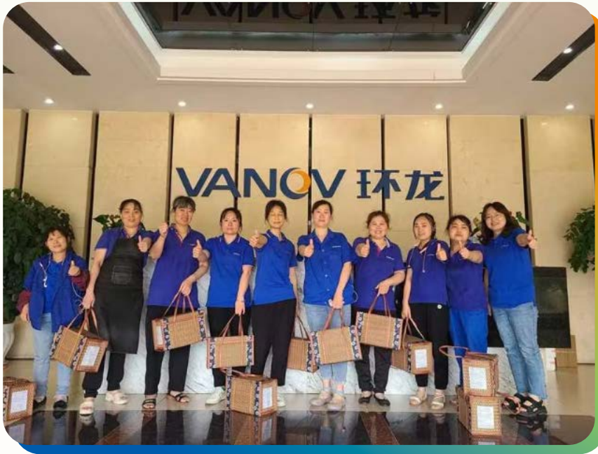
“Dragon Boat Festival Huanlong staff caring activities” 「端午環龍員工慰問活動」

為加強員工的凝聚力，我們定期舉行各項團建活動，增加員工對工作的積極性，對業務的戰鬥力，對同事間的關懷心，調節緊張的工作情緒，令員工全面身心發展。本年度，本集團舉行了營銷技術人員團建活動、新年跨年跑、三八婦女節、端午節、中秋節員工慰問活動。