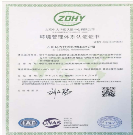
“GB/T 24001-2016/ISO 14001:2015 environmental management system requirement and use guide” certificate of Sichuan Huanlong Technology Fabrics Co., Ltd.

四川環龍技術織物有限公司「GB/T 24001-2016/ISO 14001：2015環境管理體系要求及使用指南」證書