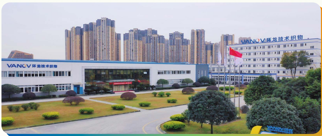
Chengdu Production Site 成都生產基地

本集團在上海建設的上海智能製造基地為造紙毛毯行業全球最高水平的智能製造生產線，該生產線與集團紙機效率優化服務系統形成協同效應，將極大提升集團產品品質和服務能力，為造紙行業在節能減排、提質增效、數字化轉型、智能製造等方面貢獻力量。