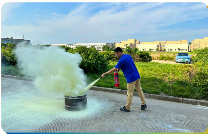
Fire Training and Fire Drill 消防知識培訓和消防應急演練