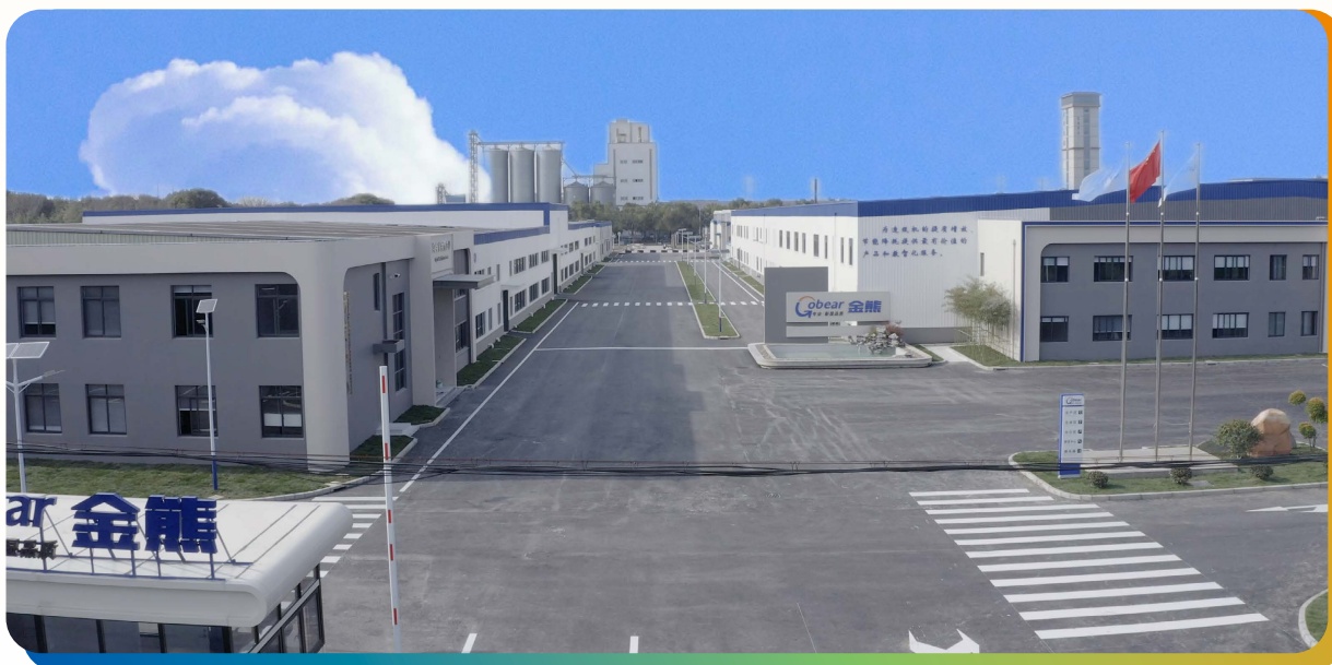
Shanghai Production Site 上海生產基地