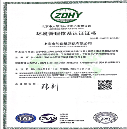
“GB/T 24001-2016/ISO 14001:2015 environmental management system requirement and use guide” certificate of Shanghai Jinxiong Paper Making Net Carpet Co., Ltd.

上海金熊造紙網毯有限公司「GB/T 24001-2016/ISO 14001：2015環境管理體系要求及使用指南」證書