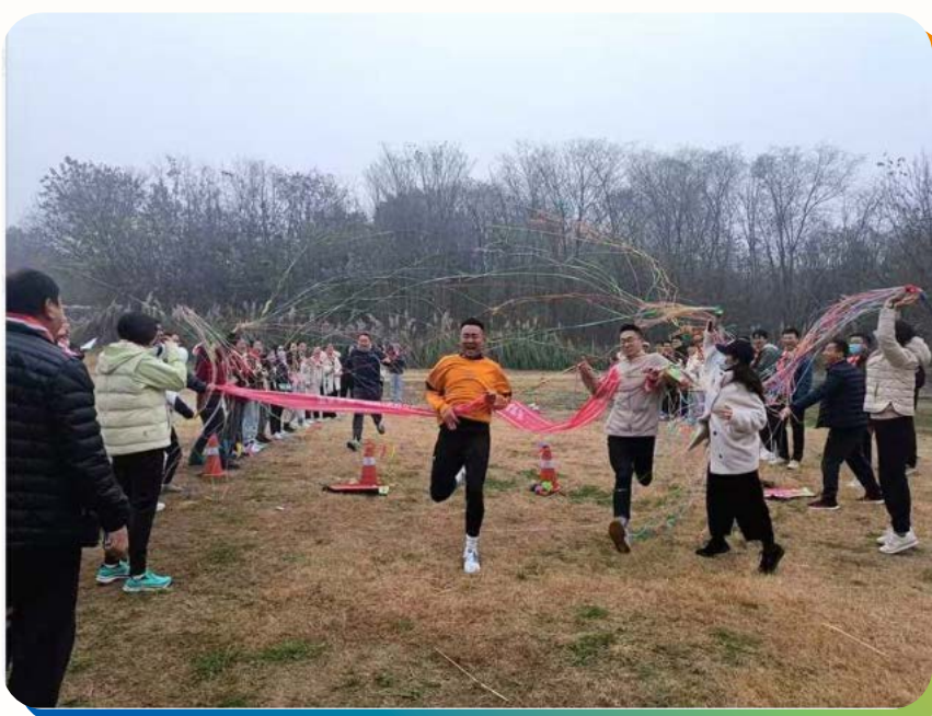
“New Year's Run” 新年跨年跑活動