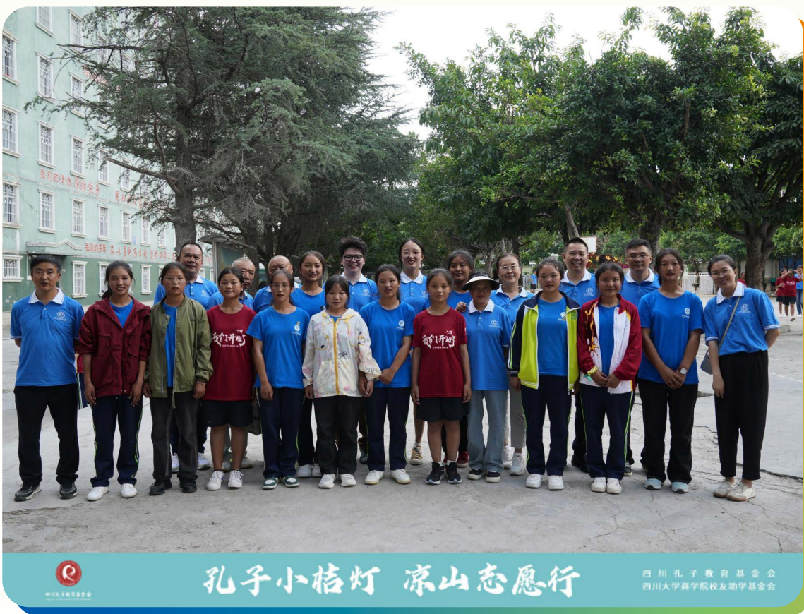
Cooperate with Sichuan Confucius Foundation to launch the “Confucius Light of Hope, Liangshan Voluntary Initiative” at Lvyin School of Xichang 攜手四川孔子基金會前往西昌市綠蔭學校共同開展「孔子小桔燈，涼山志願行」