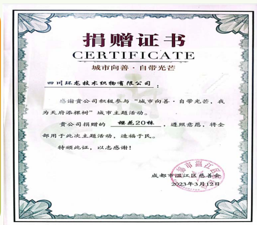
Donation and tree-planting activity 公益捐贈植樹活動