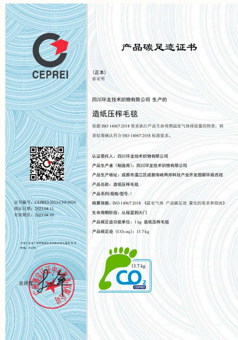
碳足迹测算證書 — 技術織物