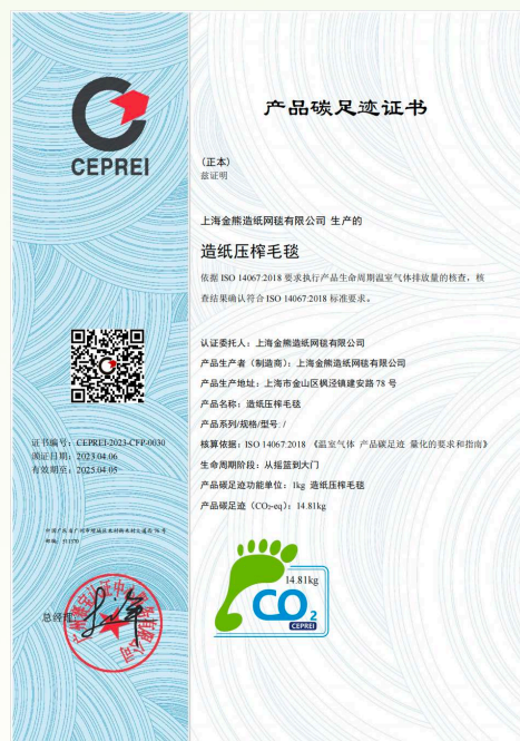
碳足迹测算證書 — 上海金熊