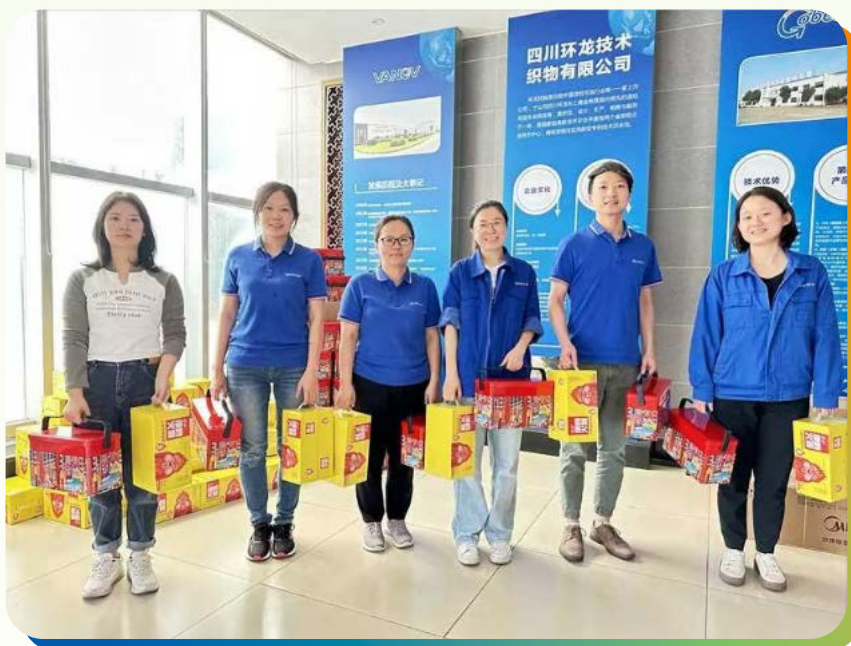
“Mid-Autumn Festival employee caring activities” 中秋節員工慰問活動