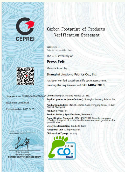
Carbon Footprint of Products Verification Statement — Shanghai Jinxiong