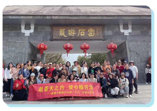
The Group Hospitals organize a variety of outdoor activities.