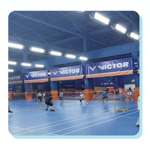
The Group Hospitals offer a variety of leisure activities for employees.