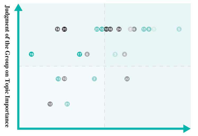
Judgment of Stakeholders on Topic Importance

The Group identified topics according to the requirements under Guide for ESG Reporting and survey results after considering the demand of stakeholders and the long-term strategic development of the Company.