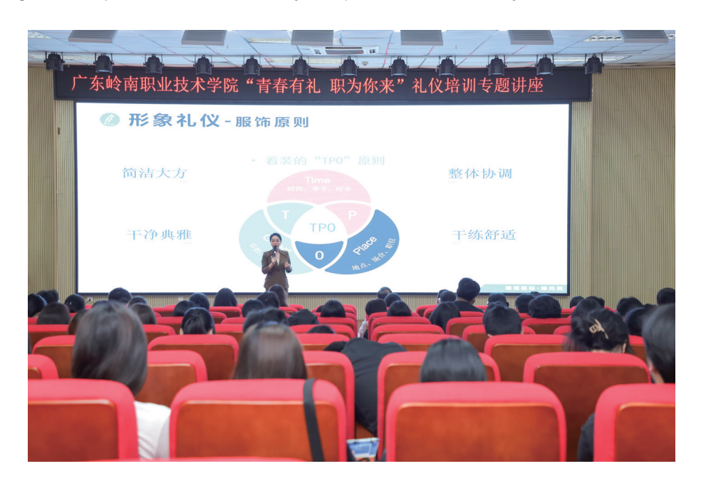
Guangdong Lingnan Institute of Technology's "Youth and Courtesy, Jobs Are Here for You" Etiquette Training Special Lecture

In addition, we offer career guidance courses on employment rights, policies and regulations to enhance students' understanding of legal requirements and personal rights. Every year, we conduct a graduate employment intention survey and a graduate employment follow-up survey to understand graduates' employment status and feedback on employment services, major teaching, employers' satisfaction, etc. Based on the information, we adjust education and teaching policies and strategies to help students successfully find jobs more effectively.