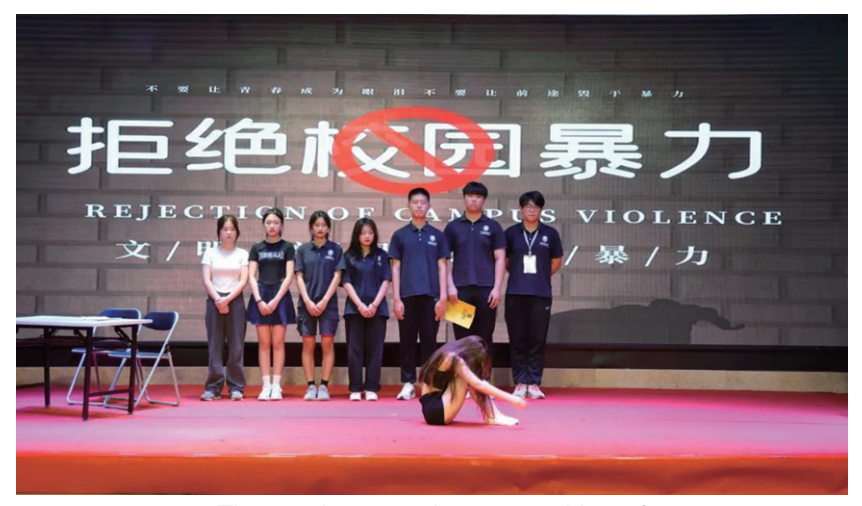
The youth stage play competition of "Fall in love at the first glance, it's just you in the drama" (一見傾心, 劇然是你)

In addition, Guangdong Lingnan Modern Technician College launched the youth stage play competition of "Fall in love at the first glance, it's just you in the drama" (一見傾心, 劇然是你), providing students with a platform to interpret themselves through performance. Based on students' emotional experience, interpersonal situations and life events in daily life, the stage play provides the participating students with an opportunity to experience, perceive and express their emotions, and also provides students who watch the performance with a way to learn emotional expression, interpersonal communication and healthy lifestyle.