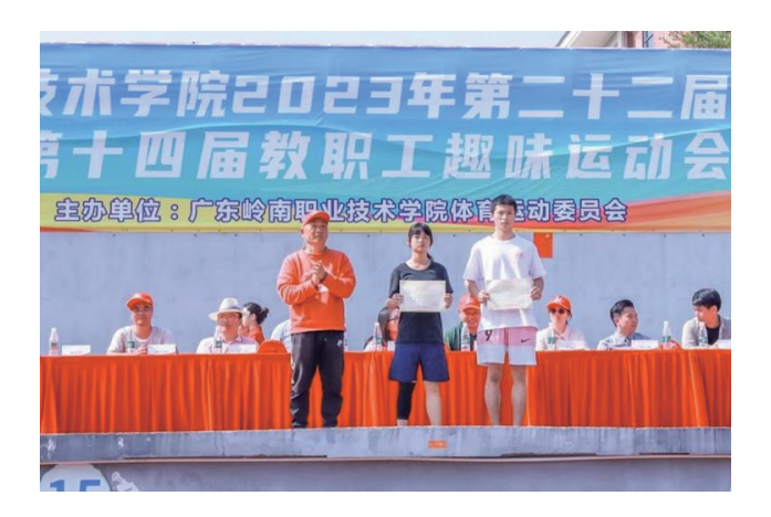
The 22nd Track and Field Games and the 14th Fun Games for Faculty of Guangdong Lingnan Institute of Technology

During the Year, we organized a series of activities aimed at relieving employees' work pressure and promoting their mental health. These activities not only help employees relax, but also help foster corporate culture and strengthen the atmosphere of teamwork among employees, thus enhancing their sense of belonging to the organization. Through these well-planned activities, we aim to create a supportive workplace with a pleasant working environment to enhance the overall well-being and job satisfaction of our employees.