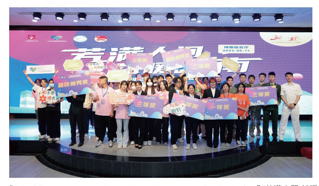
The first "Full of Fragrance in the World, Warm Lingnan with Public Welfare" (芳滿人間 益暖嶺南) Public Welfare Project Innovation Competition

During the Year, the Group donated RMB1.45 million and the Lingnan Educational Charity Foundation invested RMB14,761,500, with a total of 1,400 employees and 6,166 students participating in community welfare activities.