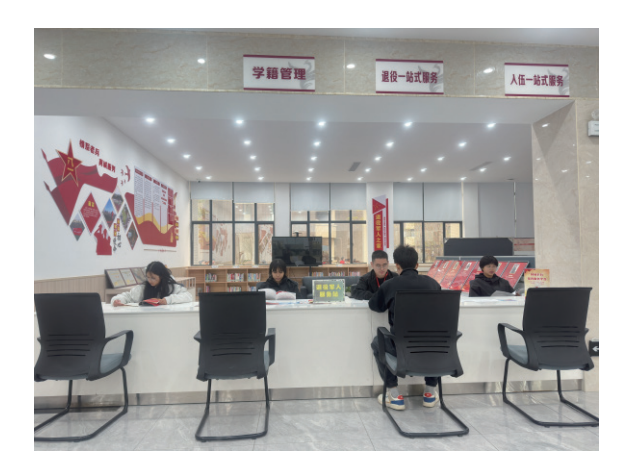
Service center for veterans

Guangdong Lingnan Institute of Technology also set up the Rural Revitalization College and jointly established service education and training bases with government entities and various villages and towns, such as the training base for Chinese and Western medicine skills at the Qingyuan Qingfeng School (清遠市清風學校中西藥技能人才培訓基地), the Yi Zhen Yi Xian training base for textile and garment skills ("一針一線"紡織服裝技能人才培訓基地), the training base for high-quality farmers at the Agriculture Bureau (農業局高素質農民培訓基地) and the training base for talents at the Military Entrepreneurship College of the Veterans Affairs Bureau (退役軍人事務局軍創學院), and launched 16 vocational and skills-based training programs. During the Year, the Colleges and Human Resources and Social Security Bureau of Qingyuan Municipal jointly established the "Yi Zhen Yi Xian training base for textile and garment skills", which provided training to a total of 290 persons. In addition, in cooperation with government, we have set up one service center for veterans and five second-level service stations for veterans. During the Year, a total of 470 veterans were recruited for capacity enhancement training for cadres and employees, job suitability training and vocational skills training to help them solve their employment problems.