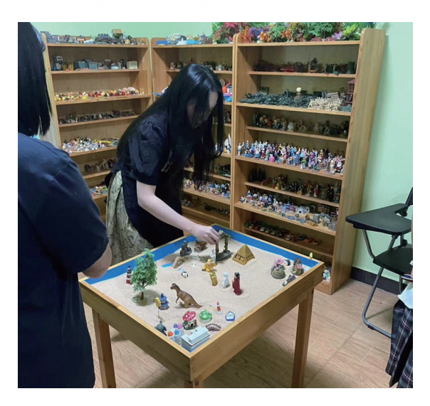
Sand Table Experience Activity

During the Year, Guangdong Lingnan Modern Technician College organized the "Sand Table Experience Activity" (沙盤體驗活動) to encourage students to understand their inner self through the sand table and to experience the endless charm of the sand table game.