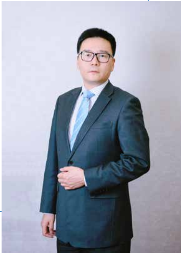
Chairman Wu Lei

In 2023, the world economy exhibited a sluggish recovery, and geopolitical conflicts became more acute. The domestic economy grew in a wave-like fashion amid twists and turns, and recovery and growth were boosted. During the Reporting Period, in the face of both opportunities and challenges in the external environment, solidly promoted the implementation of the Group's "14th Five-Year Plan" strategy, and the overall operation of the Company was stable and orderly.