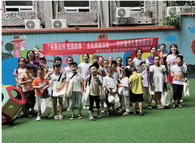
Reading Activity in the Erma Road Community, Tongchuan District

The Group actively organizes reading activities to safeguard the reading dreams of left-behind children. In July 2023, the community reading activity “Joyful Reading in Dazhou in All Seasons” took place in the Erma Road Community, Tongchuan District, Dazhou City, Sichuan Province. A total of 35 children participated in the event. They experienced in-depth reading of picture books and reading sharing by Sister Winshare, and actively participated in fun games. Through this activity, the children were guided to read more books and good books, allowing the merits of books to accompany their growth.