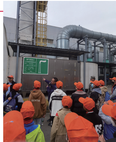
Explaining the Environmental Printing Equipment

On 17 March 2023, Sichuan Xinhua Printing explained the printing craft to the teachers and students of Guanghan Sanshui Primary School, showed them environmental printing equipment to elaborate on the working principle of the equipment, and encouraged the students to establish the awareness of environmental protection and to practice the concept of green environmental protection.