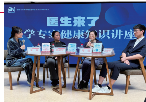
Love Reading, I do – Weekend Reading Sharing Session