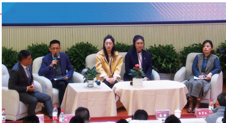
The Group collaborated with the Education Bureau of Wenjiang District, Chengdu City to hold a public lecture on "How Parents of Elementary School Students Can Accompany Their Children to Grow and Learn"

To enrich the service forms in the field of education, assist local education authorities in providing guidance for family education, and promote the development of a conducive home-school partnership, the Group has collaborated with education authorities, schools, and communities in multiple regions. The Group has organized public welfare lectures on family education for the majority of students' parents covering topics such as parent-child companionship, communication during adolescence, career planning, and identifying and preventing psychological issues. The Group has also invited renowned teachers to share their insights and provide guidance on parent-child interaction, developmental direction, and approaches of companionship; through live streaming, recorded short videos, and parenting articles distributed through WeChat official account, the Group aims to enhance the level of family education and promotes the healthy growth of students. During the Year, the Group has organized 10 public lectures on family education, combining on-site presentations and live streaming, with the online audience number reaching 200,000. The Group has interviewed 29 renowned teachers from 21 schools and produced 57 videos, which were released on WeChat Channel "Quality Learning with Winshare", with an average of approximately 14,000 views per video.