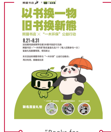
"Books for Goods, Old Books for New Bears"

Panda Bookstore collaborated with "One More Green" to launch the "Books for Goods, Old Books for New Bears" public welfare activity. Readers could exchange their old books for co-branded blind box gift packages, allowing them to participate in the process of resource recycling, thus raising their concern and contemplation about environmental protection.