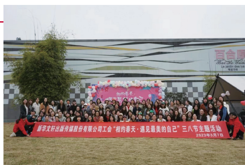
"Embrace Spring: Discover Your Inner Beauty" International Women's Day Celebration

The Group conducts a diverse range of cultural activities to strengthen unity and foster a positive and harmonious work environment. In 2023, the Group organized events such as the "I Love Dunhuang" film screening, "Winshare Voice" Top Ten Singer Competition, "Vibrant Winshare: Embrace the Joy of Sports" Employee Sports Day, and the "Embrace Spring: Discover Your Inner Beauty" International Women's Day celebration. These activities well promote the physical and mental well-being of employees, help disseminate corporate culture, and substantially enhance employees' sense of happiness and belonging.