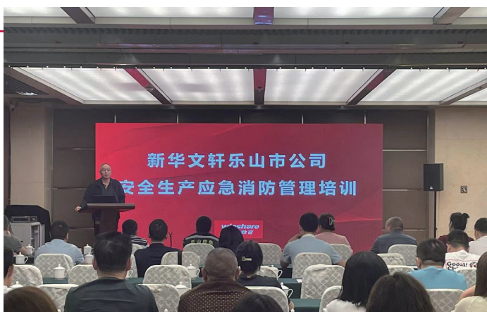
Emergency Fire Training for Workplace Safety

In an effort to enhance the safety awareness, disseminate safety knowledge, and elevate safety skills among managerial and staff members, the Company's Leshan Branch organized a specialized training session from 13 to 14 July 2023. Internal and external experts in safety and emergency management were invited to address topics such as workplace safety, emergency preparedness, and fire safety. The training further reinforced the safety responsibility awareness among staff members, heightened their awareness of safety precautions, and sharpened the safety skills and emergency response capabilities of both managerial and staff members. The entire managerial and staff team of the Leshan Branch participated in this training.