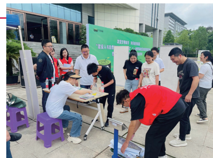
One More Green in Government Offices and Communities

The "One More Green in Government Offices and Communities" public welfare activity took place at the Planning Exhibition Center in Jianyang City, Sichuan Province. 30 government agencies and institutions in the city participated in the event. In total, approximately 656 kilograms of waste books and newspapers were collected.