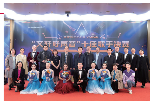
"Winshare Voice" Top Ten Singer Competition