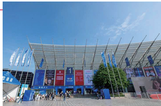
Main exhibition venue of 2024 Tianfu Book Fair