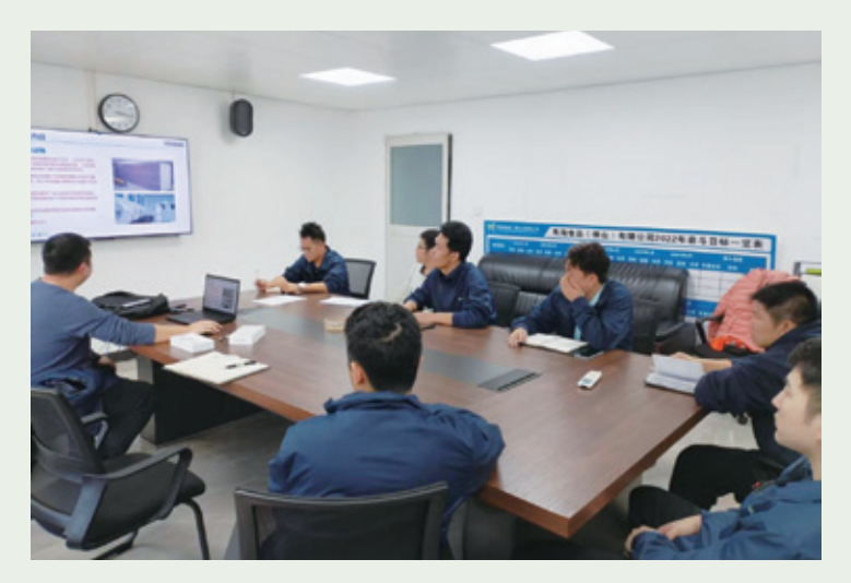
Training on Quality Management Standards for Pig Slaughtering

In December 2023, the Group conducted a programme on the key points of quality management and good practices in pig slaughtering for front-line managers of the production departments and quality management departments. This training enabled the front-line managers to fully understand the good practices and requirements from food production, processing, packaging, storage, transportation to sales, and further enhanced the professional knowledge of the front-line managers.