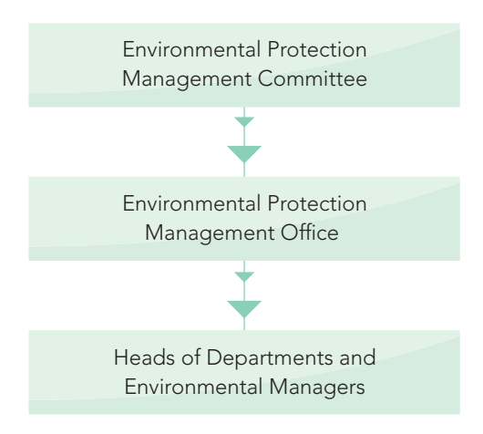
Environmental Protection Management Committee Structure

The Group has set up a dedicated Environmental Protection Management Committee ("the Committee"), to supervise and implement environmental protection and promote the Company's sustainable development. The Committee is mainly responsible for organising, supervising and implementing environmental protection work, and paying attention to changes in environmental protection laws and policies, and formulating and updating the Company's management policies. The Environmental Protection Management Office under the Committee is responsible for monitoring all departments in their waste management, resource management and operation of the environmental management system. It also guides the departments and environmental managers on cleaner production and daily pollutant detection, and carries out employee training on environmental protection.