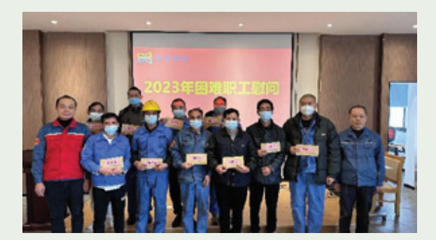
Visiting Employees in Need

This year, the Group provided comfort to employees in need. By providing material and financial assistance, we show care and sympathy, and bring warmth to those in need.