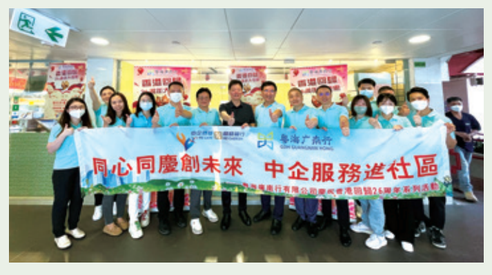
"Chinese Enterprises Serve the Community" Campaign

In response to the call of the Hong Kong Chinese Enterprises Association, we organised the "Celebrate and Create the Future Together: Chinese Enterprises Serve the Community" campaign to celebrate the handover. The Group's food retail stores in Hong Kong launched a special promotion throughout the month and distributed Four Treasures blessing packs to the public to celebrate the handover, thereby benefiting the local community in a practical manner. We will continue to take root in the grassroots community and adhere to the business philosophy of "quality first, service first, integrity and responsibility, cooperation and win-win cooperation" to serve Hong Kong people with better products at more affordable prices and fulfil our commitment to Hong Kong.