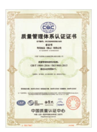
ISO 9000 Quality Management System Certification