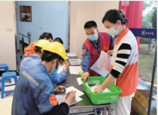
Voluntary Blood Donation Campaign