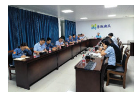
Conference on Integrity

We also put great efforts into integrity promotion and education. This year, we complied an anti-corruption handbook and organised anti-corruption and integrity training for directors and employees.