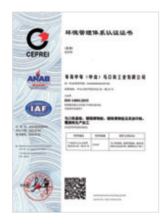
ISO 14001 Environmental Management System Certificates

In order to respond to emergent environmental pollution incidents effectively, and to minimise the impact of accidents on the environment, the Group has developed Emergency Plans for Emergent Environmental Incidents in accordance with the Emergency Response Law of the People's Republic of China, the Administrative Measures for the Recording of Emergency Preparedness for Environmental Emergencies of Enterprises and Institutions and other relevant laws and regulations, to standardise the emergency treatment and rectification measures of hidden dangers. The Group's Production Safety Management Department takes a lead in inspecting hidden hazards, handling major emergencies, and regularly organizing emergency drills, to ensure an efficient response to environmental emergencies. Meanwhile, the Group has installed different monitoring equipment to monitor the real-time environmental conditions of the plants, and installed anti-leakage pools at hazardous chemical storage sites to avoid major leakage. We also have emergency supplies with inspection, protection and communication functions to deal with environmental emergencies.