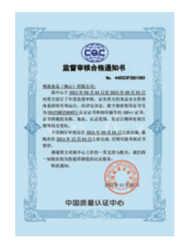
ISO 22000 Validation Notice