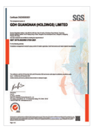
Compliance System Certification of the Group