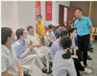
Training on Mental Health