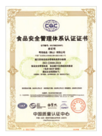
ISO 22000 Food Safety Management System Certification