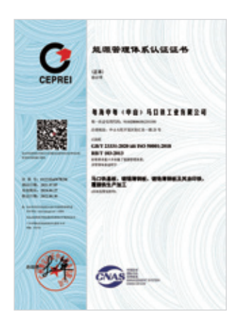
ISO 50001 Energy Management System Certification

The energy used by the Group's fresh and live foodstuffs business includes fuels such as gasoline, diesel and liquefied petroleum gas and electricity. The fuel relates to direct energy consumption, mainly for vehicle use. Electricity relates to indirect energy consumption, mainly used for office and plant operations. In terms of green travelling, the Group advocates the use of new energy vehicles, reduces the use of fuel, and encourages the use of public transport. In terms of power saving, the Group adjusts the use of equipment in the production workshops according to the seasons and conducts inspections, switches off idle equipment in a timely manner, and conducts energy consumption statistics for workshops and assesses them through energy consumption costing.