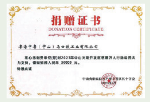
Donation Certificate for "Charity Walk" Event 2023

Since 2021, we have been donating RMB30,000 annually to the Torch Development Zone in Zhongshan City in support of the "Charity Walk" event. This event aims to promote the spirit of fraternity and the concept of life first, and foster a positive social culture of mutual assistance, thus contributing to the building of a civilised community.