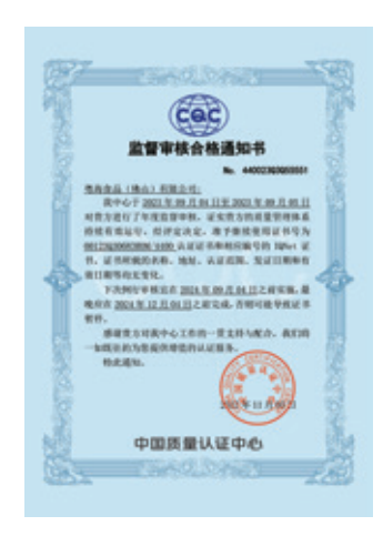
ISO 9000 Validation Notice