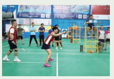
Cultural and Sports Activities for Employees