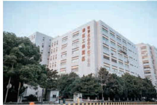
TOMSON WAIGAOQIAO INDUSTRIAL PARK 湯臣外高橋工業園區