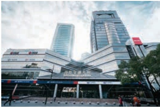
TOMSON COMMERCIAL BUILDING 湯臣金融大廈