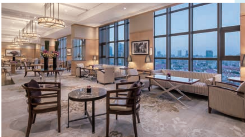
INTERCONTINENTAL SHANGHAI PUDONG 上海錦江湯臣洲際大酒店

本集團持有位於浦東陸家嘴之上海錦江湯臣洲際大酒店之50%權益。該酒店於回顧年度錄得平均入住率約71.20%，而本集團從該項投資中攤分溢利淨額22,645,000港元（二零二二年：虧損淨額15,289,000港元）。業績大幅改善主要歸因於後疫情時代經濟活動復甦。此外，於二零二三年內，酒店跟當地政府確認就2019冠狀病毒病於二零二二年上半年在上海市蔓延而為來自其他省份的醫務人員提供宿舍的租金金額，且該款項已全額收妥。預計該酒店於二零二四年的經營業績將進一步改善。該酒店管理層將繼續集中力量控制經營成本、加強客房業務及餐飲業務之推廣，以維持酒店之盈利。