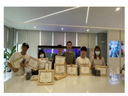
Outstanding Employee Recognition

In order to reduce the stress of our staff at work and to enhance the team spirit among staff and their sense of belonging to the Group, we organize after-work activities for our staff. This year, we held the "Gold of Desert King" activity.