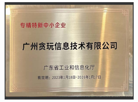
Specialized, High-end and Innovationdriven Small and Medium Enterprises