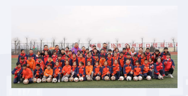
The awarding ceremony of the first batch of scholarships