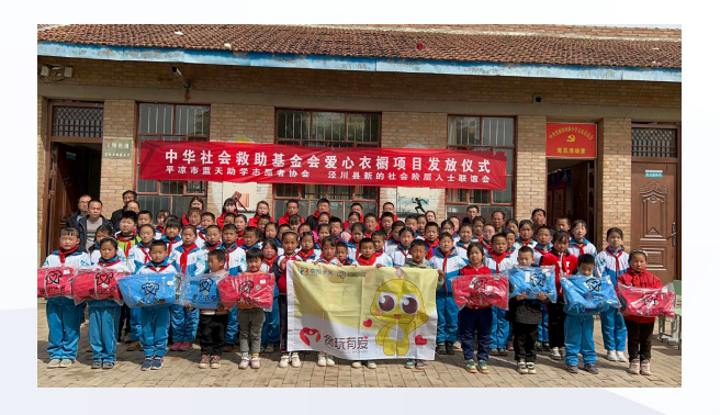
Charitable donation to "Love Closet"