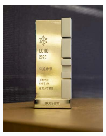
"King's Boat — Favorite Talent Employer Award" from BOSS ZHIPIN.

We attaches great importance to talent cultivation and management training. In 2023, we organized 39 learning and training activities for new and old employees, including "New Employee Orientation", XMTSBU "Gold of Desert King", "Management Training: Information Acquisition, Structured Thinking, Depth Thinking", "AIGC Business Sharing".