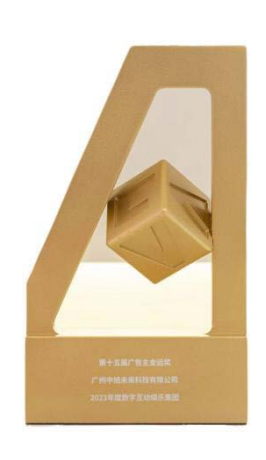
Digital Interactive Entertainment Group of the Year 2023