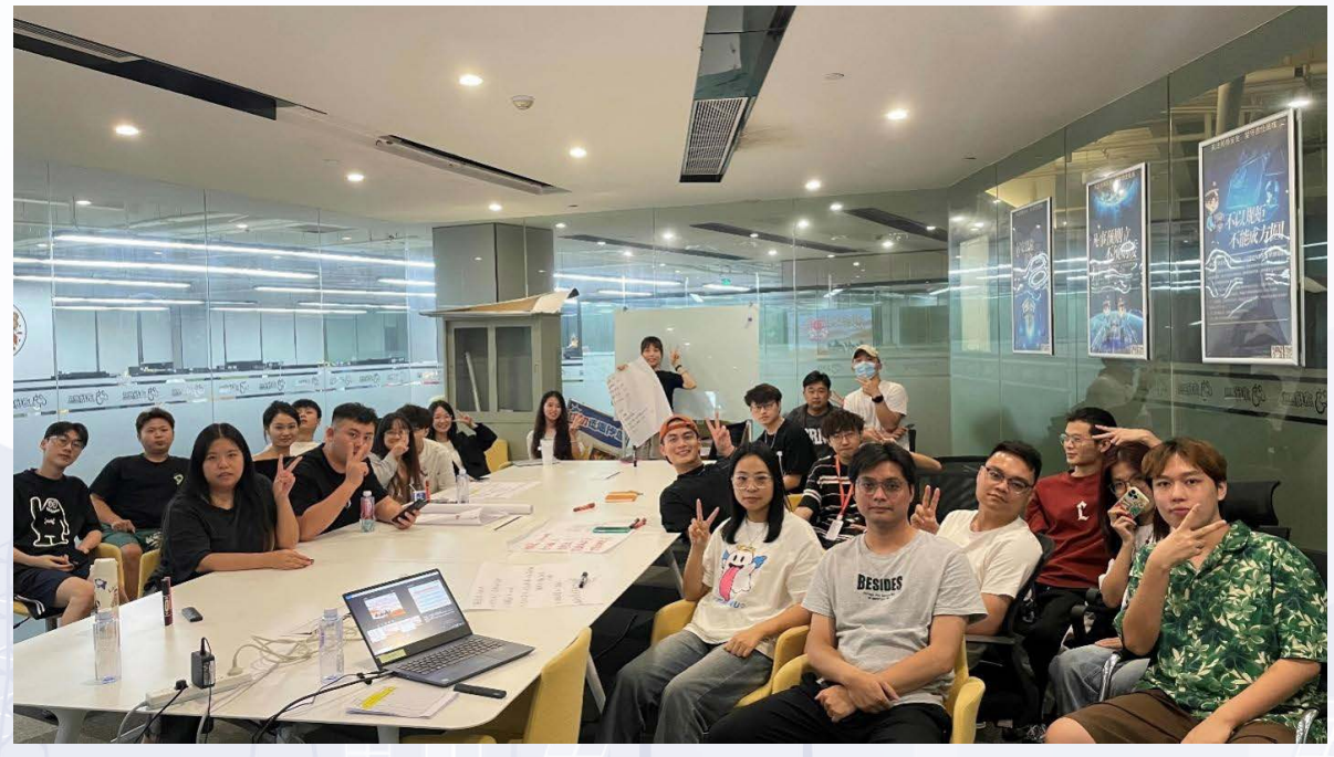
"Gold of Desert King" Activity

In order to reduce the stress of our staff at work and to enhance the team spirit among staff and their sense of belonging to the Group, we organize after-work activities for our staff. This year, we held the "Gold of Desert King" activity.