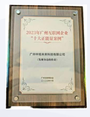
2023 "Top 10 Positive Energy Cases" of Guangzhou Internet Enterprises 《Discovering the Legends Around Us》