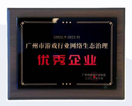
"Excellent Enterprise" in Internet Ecological Governance of Guangzhou Game Industry