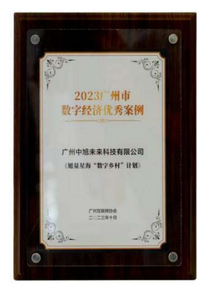
2023 Excellent Cases of Digital Economy in Guangzhou «Xuliang Xinghai "Digital Village" Plan»