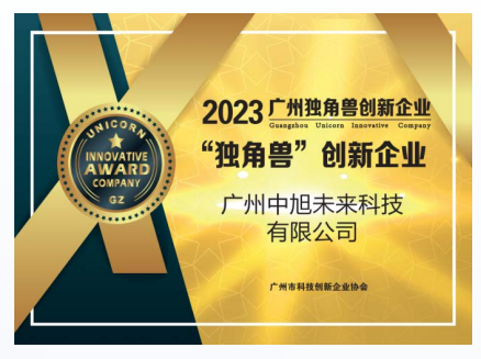
2023 Guangzhou Unicorn Innovative Enterprise