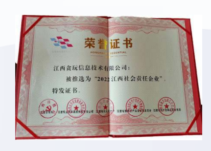
Jiangxi Socially Responsible Enterprises