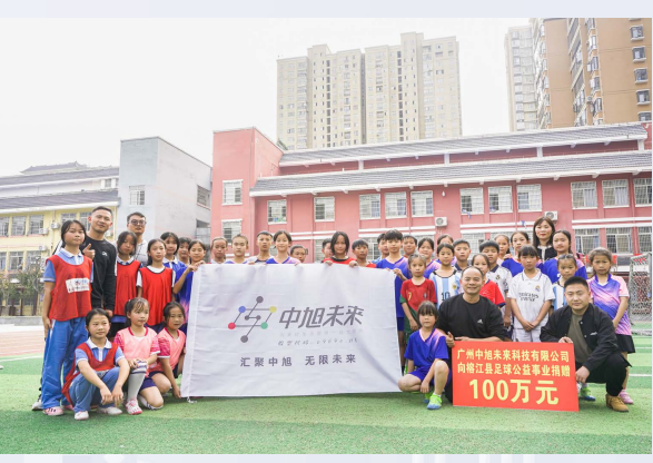
Donate to football charity