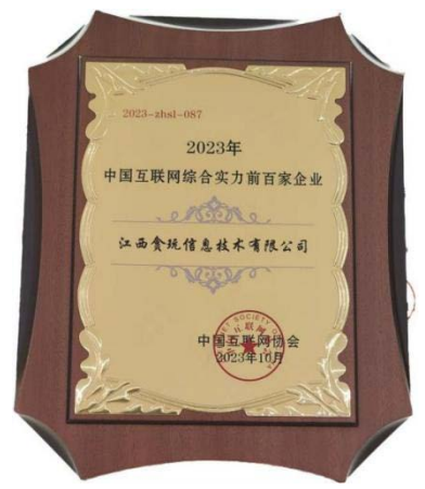
2023 Top 100 Comprehensive Strength China Internet Enterprises