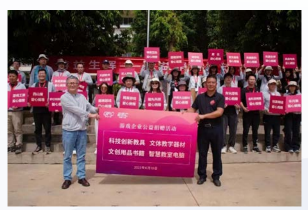
Donate stationary supplier to rural primary school in Yunnan Province

During the Year, the Group granted scholarships of RMB400,000 to Dafang Tianhe Experimental School (大方天河實驗學校) and Yuanbao Tongxin Experimental School (元寶同心實驗學校) in Guizhou Province. Study Subsidy Program of ZX Inc., an educational public welfare project selected as the "Internet Public Welfare Influence Project" (網絡公益影響力項目) by the "I Public Welfare · I Guangzhou" (公益·I廣州) online public welfare, will recruit 80 students from those schools, guiding students to be positive in study, life and ideology and morality, and motivating students to develop with an all-round moral, intellectual, physical, aesthetic and labor education.