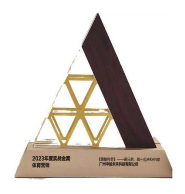
2023 Practical Gold Case Sports Marketing 《Legend of Origin》