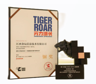
14th Tiger Tsunami Awards Bronze Award in the Game Marketing Category 《Blooded Attack》