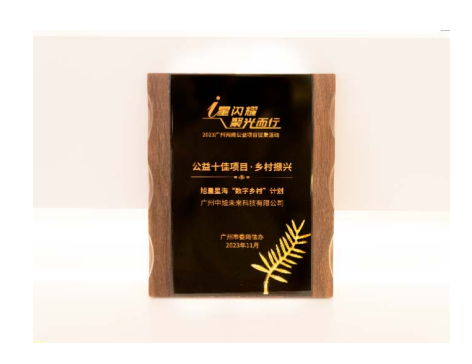
Top 10 Public Welfare Projects · Rural Revitalization