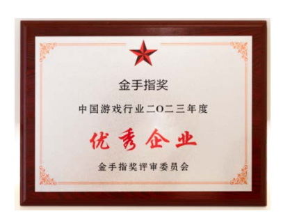
"Golden Finger" Award of China Game Industry "2023 Outstanding Enterprises of China Game Industry"