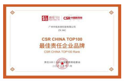
Best Responsible Corporate Brand