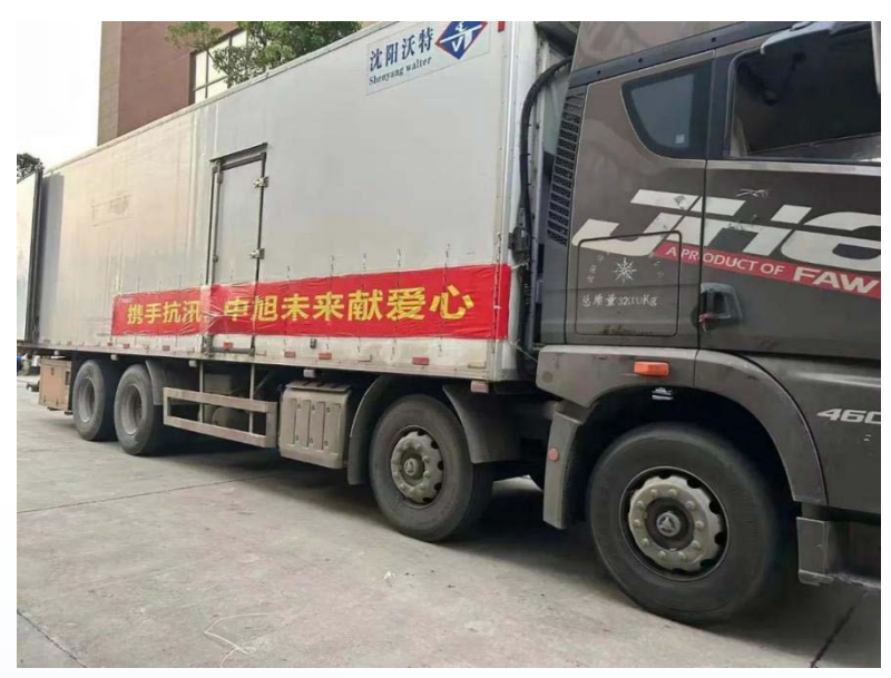
Joining hands to fight floods showing love

During the Year, the Beijing-Tianjin-Hebei region was severely affected by heavy rainstorms and floods, we took immediate measures and donated supplies to the disaster areas for disaster relief and post-disaster reconstruction. We will continue to pay attention to the development and disaster relief work in the disaster areas and carry out disaster relief work in a timely manner.