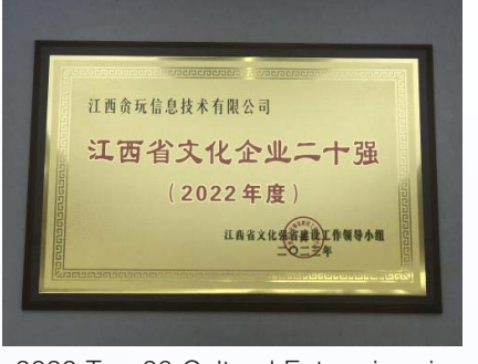
2022 Top 20 Cultural Enterprises in Jiangxi Province