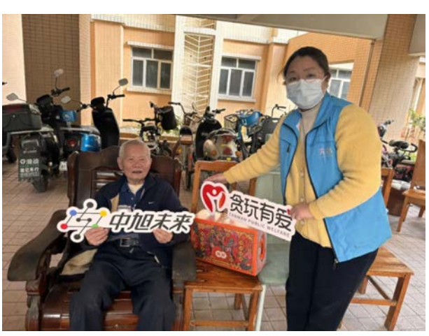
Distributed gifts to the community