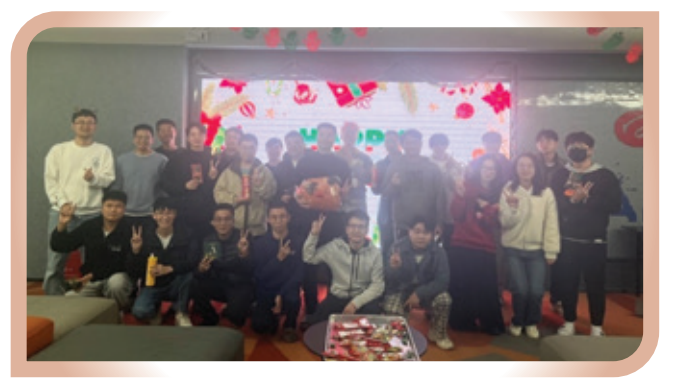
Christmas Gathering in Shenzhen Region