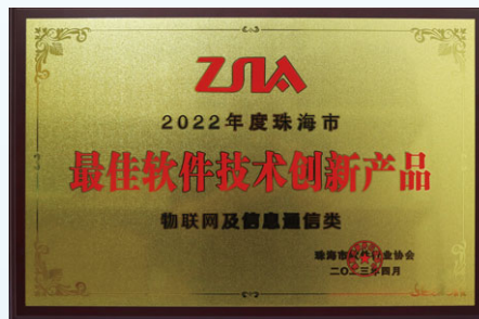
In April 2023, the new products of Zhuhai Megain were recognized as “The Best Innovative Products for Software Technology for 2022 (Internet of Things and Information Telecommunication Category)” (2022年度最佳軟件技術創新產品 (物聯網及信息通訊類) by Software Industry Association of Zhuhai City (珠海市軟件行業協會).