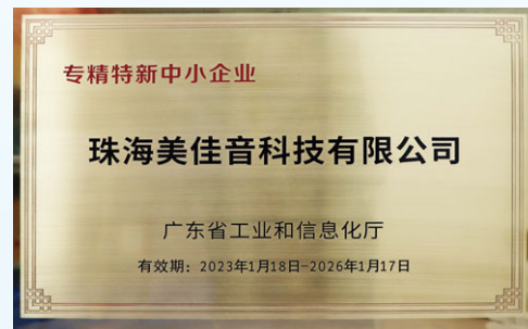
In 2023, Zhuhai Megain was awarded the title of the “Specialized and Sophisticated Small and Medium Enterprise” (專精特新中小企業) for a term of three years by the Department of Industry and Information Technology of Guangdong Province (廣東省工業和信息化廳).