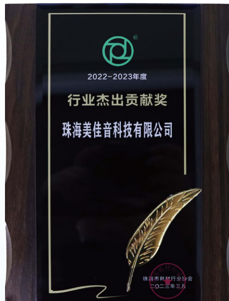
In March 2023, Zhuhai Megain was awarded “The Outstanding Industry Contribution Award for the Year from 2022 to 2023” (2022-2023年度行業傑出貢獻獎) by Office Consumables Industry Association of Zhuhai City (珠海市耗材行業協會).

The following are the major honours received by Zhuhai Megain, the business entity of the Group, in 2023: