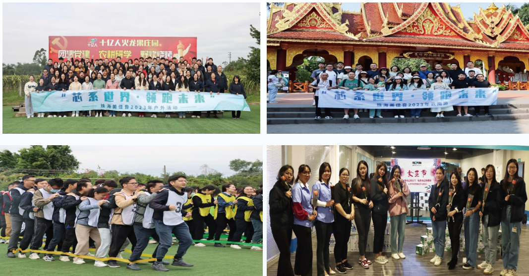
Employee caring activities

As of 31 December 2023, the Group's total employee turnover during the Reporting Period was 31, accounting for approximately 20.9% of the total number of employees in service. Among them, the number of employees lost in the quality and technical, marketing, production management, management, administration and finance, and other functions were 7, 11, 1, 1, 1 and 10 respectively, totalling 100% of the employee turnover. Geographically, 30 employees that left the company were located in the PRC and the remaining 1 employee that left the company was located in Taiwan. By gender, the turnover rate for males was 6.1% while that for females was 14.9%. By age group, the turnover rate for the age group of 25 years old or below was 8.1%; for the age group of 26 to 35 years old was 6.8%; for the age group of 36 to 45 years old was 4.1%; for the age group of 46 to 55 years old was 1.4%; for the age group of 56 years old or above was 0.7%.