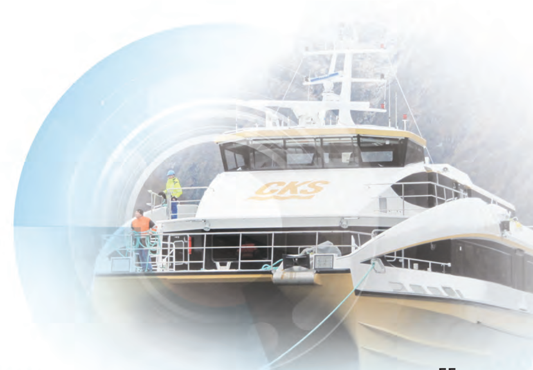
Managing Director Hong Kong, 25 March 2024